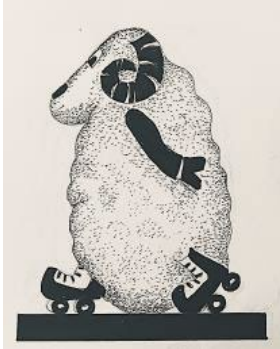
Roller Skating Upright – 1200mm Tall