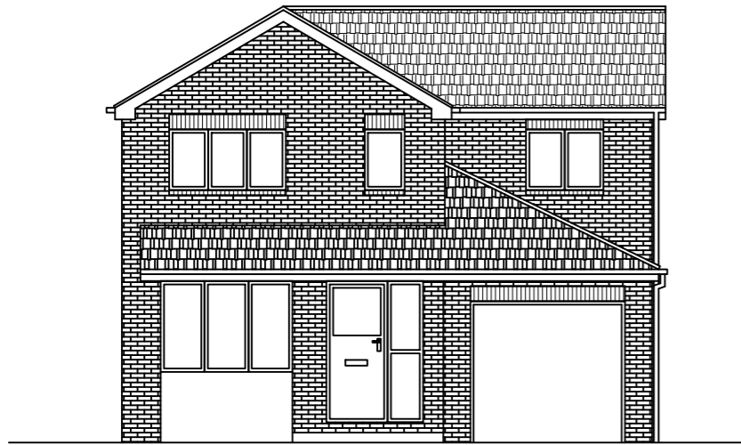
EXISTING FRONT ELEVATION SCALE 1:100 AT A3