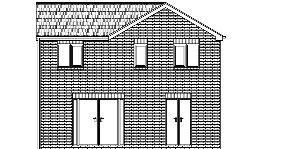
EXISTING REAR ELEVATION SCALE 1:100 AT A3