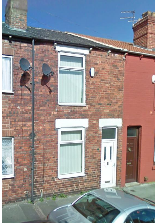
Above: Front elevation of the mid terrace property.