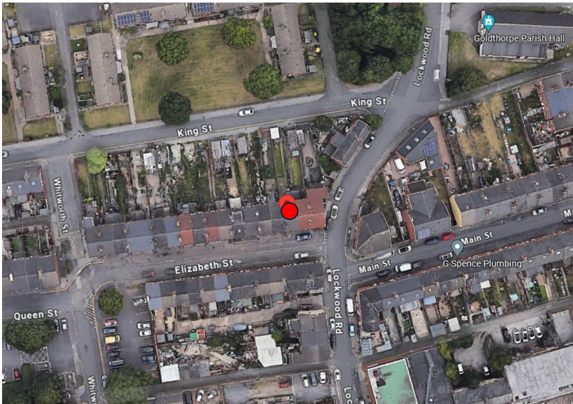
Above: Aerial Image indicating the location of the property within a residential area.