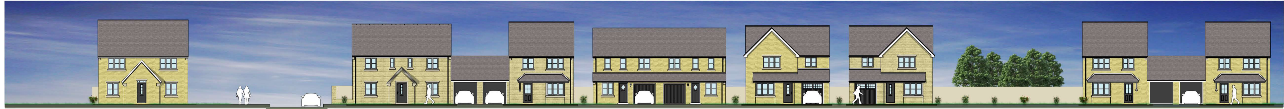
STREET SCENE A-A @ 1:200