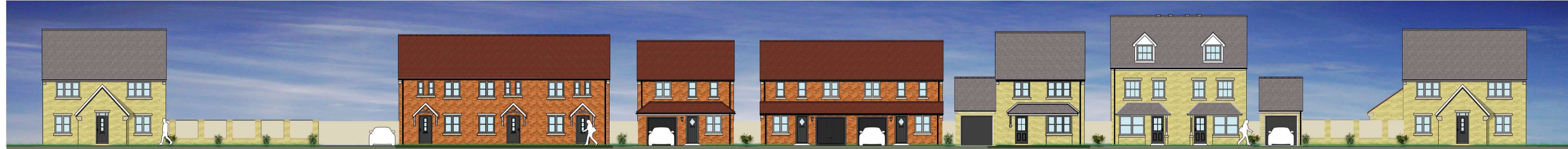
STREET SCENE B-B @ 1:200