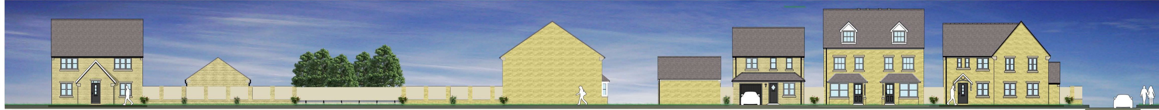
STREET SCENE C-C @ 1:200