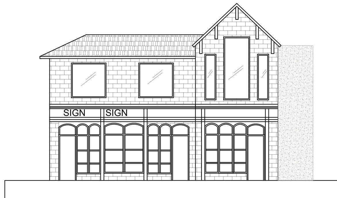
PROPOSED FRONT ELEVATION /scale 1:100/