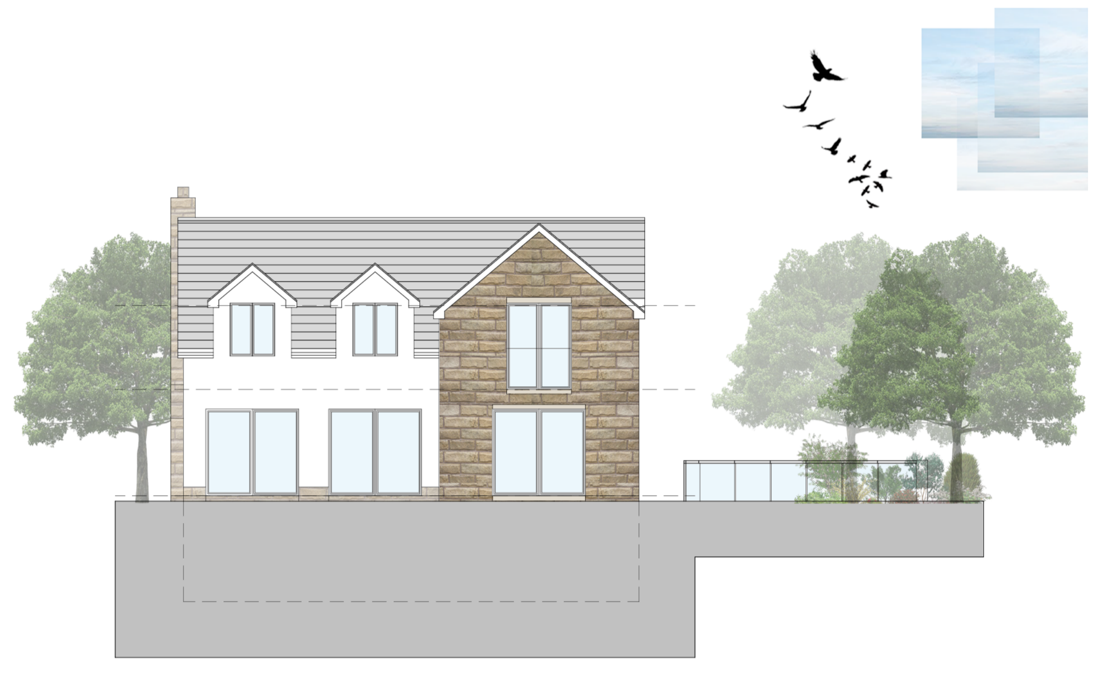
SIDE ELEVATION AS EXISTING Scale 1:100