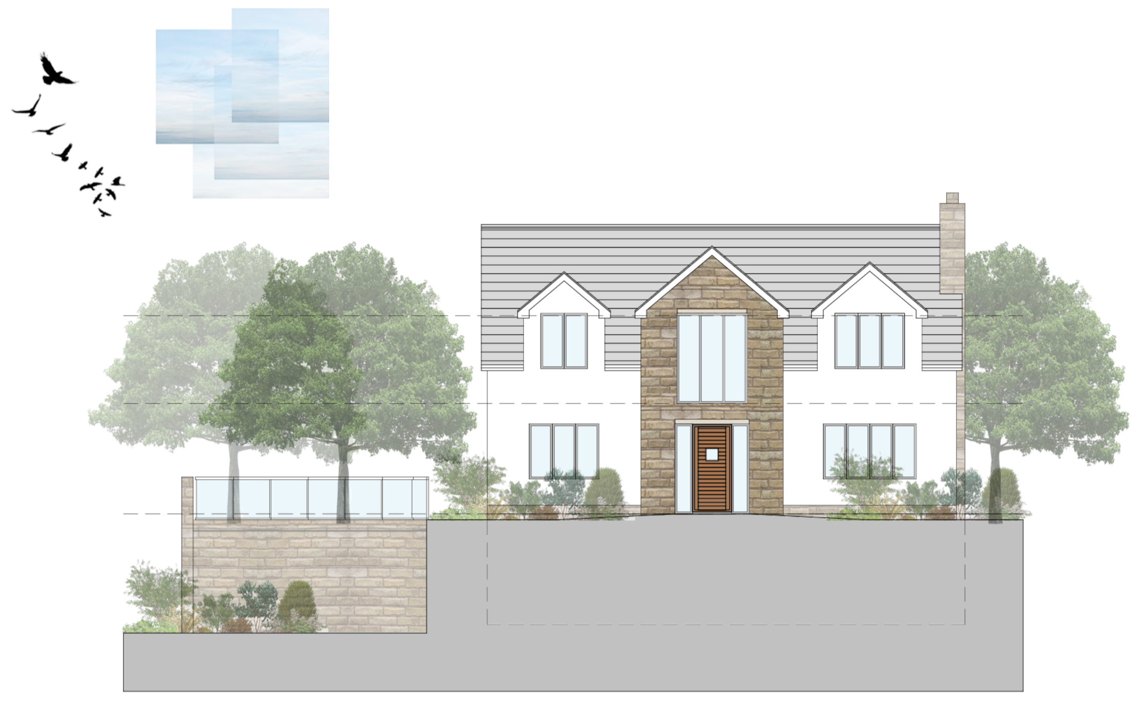
FRONT ELEVATION AS EXISTING Scale 1:100

Note: Information is based on OS map and received information and is subject to full topographical survey. Assumed site boundary and site constraints subject to legal confirmation. All Legal easements and extent of existing underground services locations are subject to confirmation.