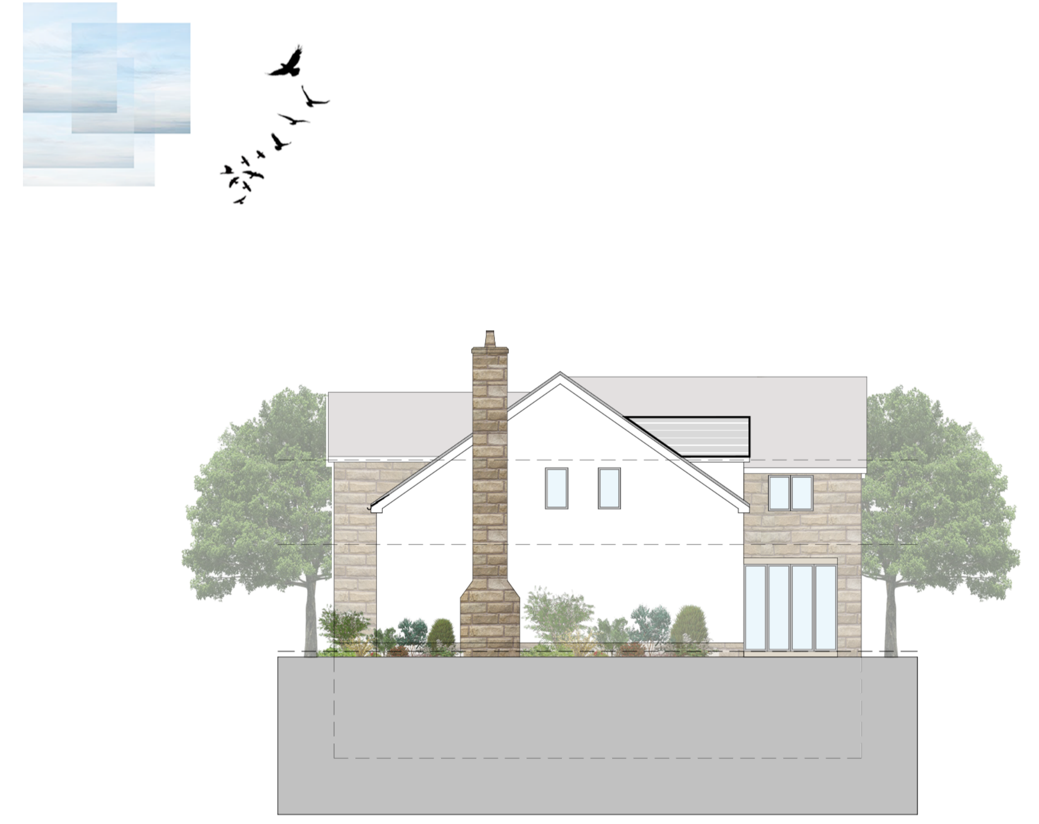
SIDE ELEVATION AS EXISTING Scale 1:100