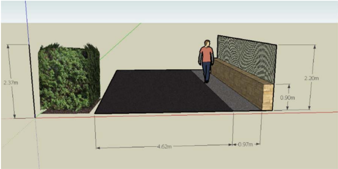
• Diagram 1 – Detail from lane