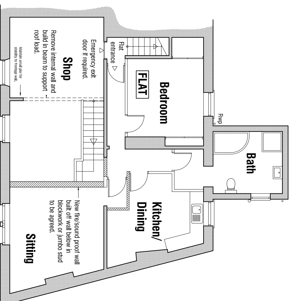
FIRST FLOOR PLAN 1:50

Remove bay window and fit traditional flush shop front within opening including central doorway.