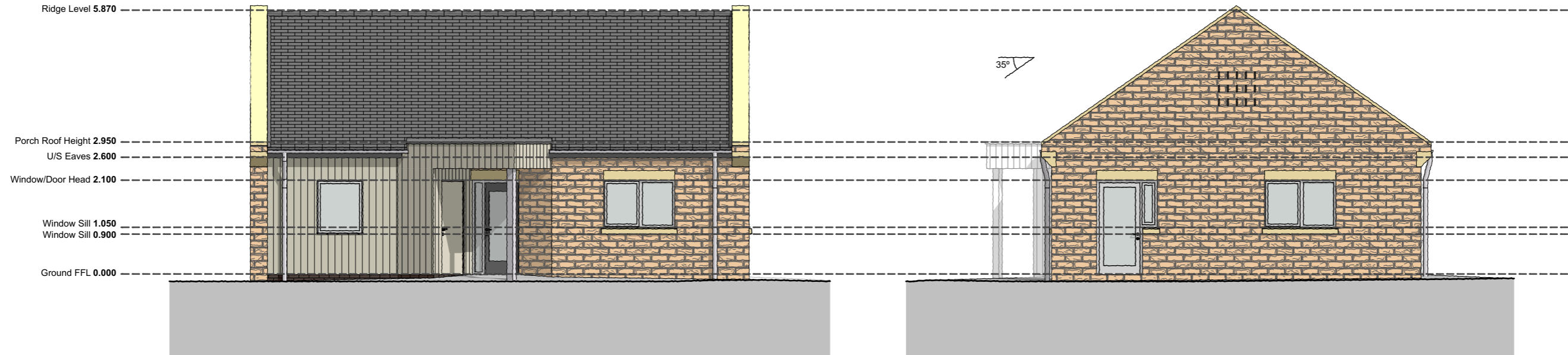
Bungalow Type 2B - Proposed Elevation A (Front) - Scale 1:100