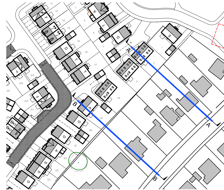
LAYOUT KEY (NTS)