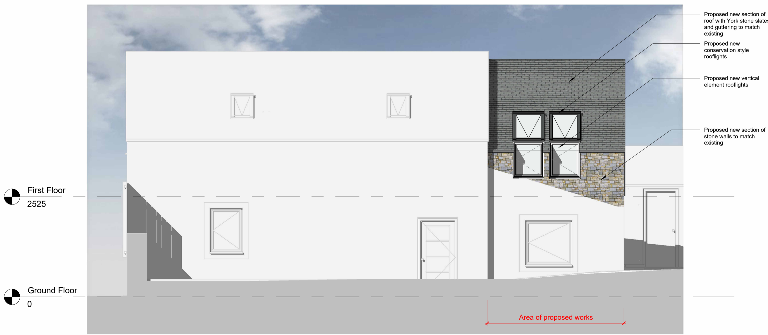
4 Proposed West Elevation 1 : 50