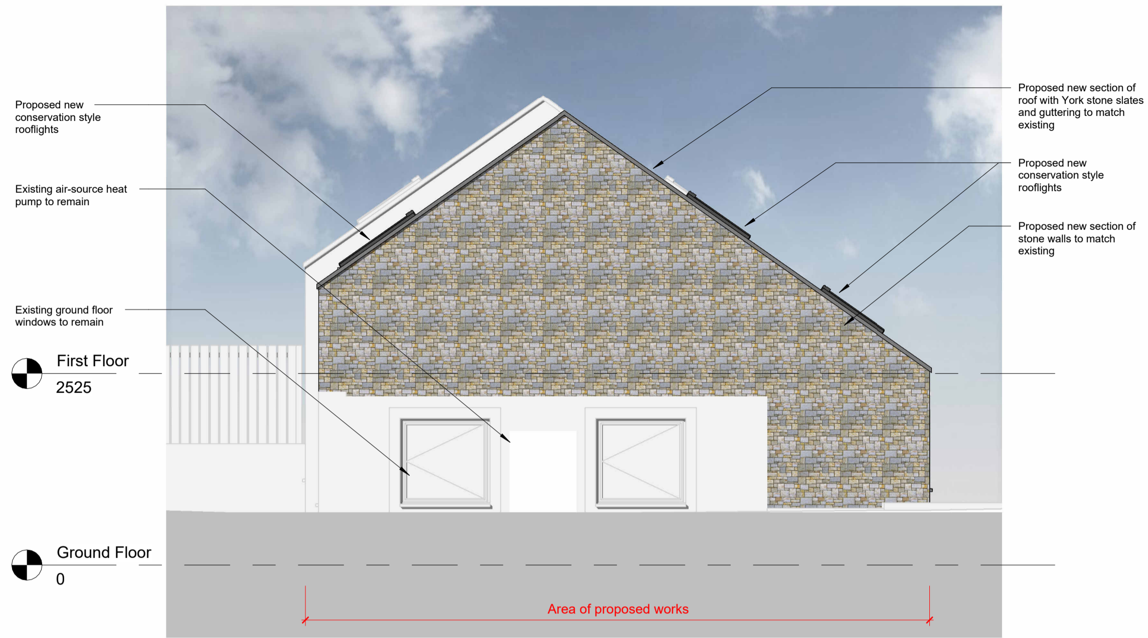
1 Proposed South Elevation 1 : 50