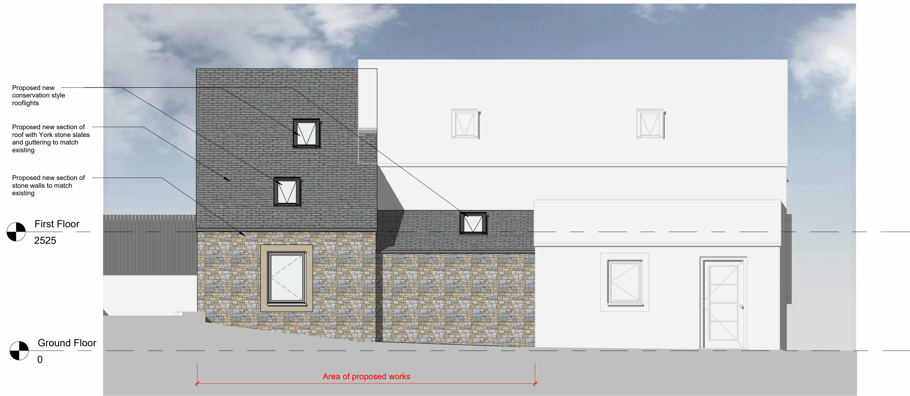
2 Proposed East Elevation 1 : 50