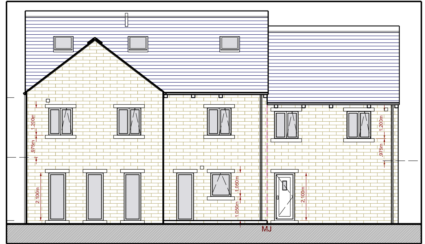
Dwelling 2 East Elevation - Proposed