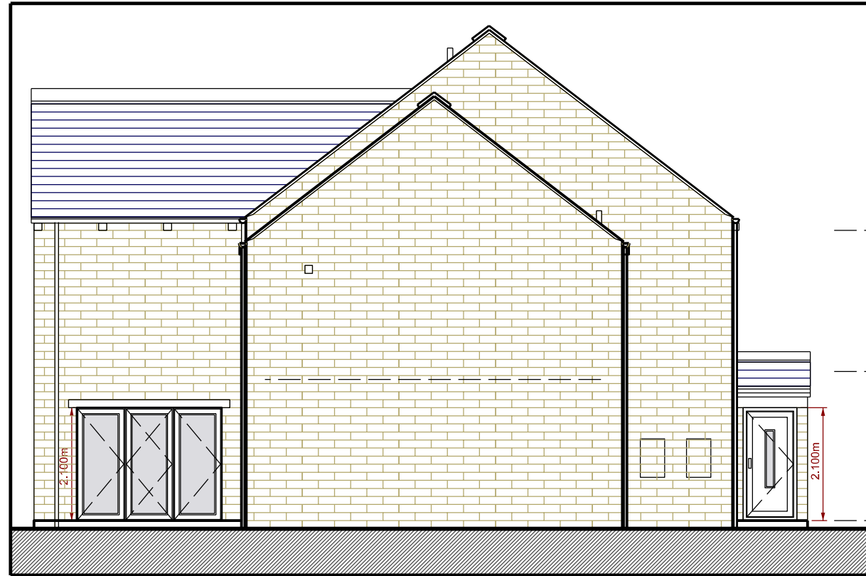
Dwelling 2 North Elevation - Proposed