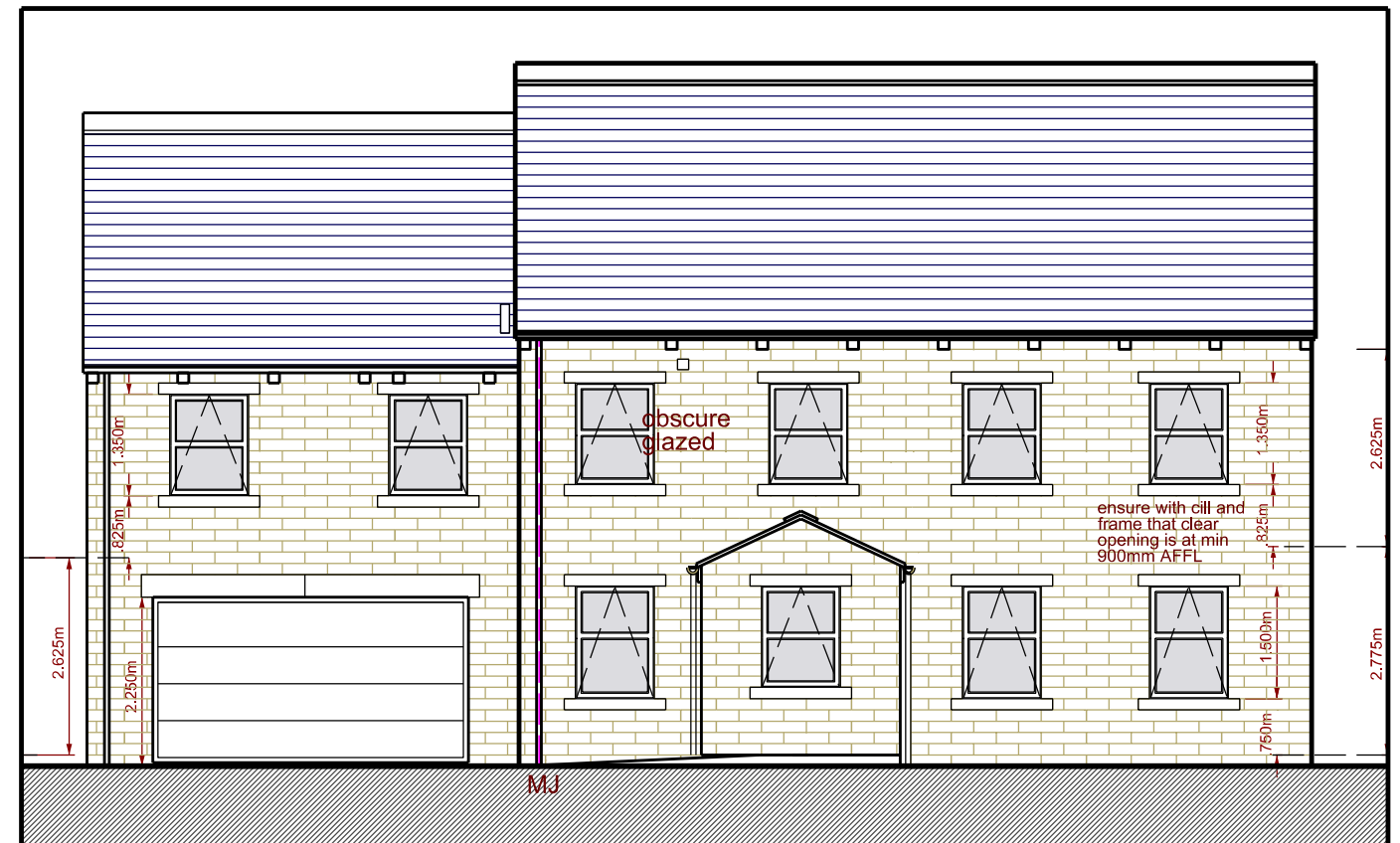
Dwelling 2 West Elevation - Proposed