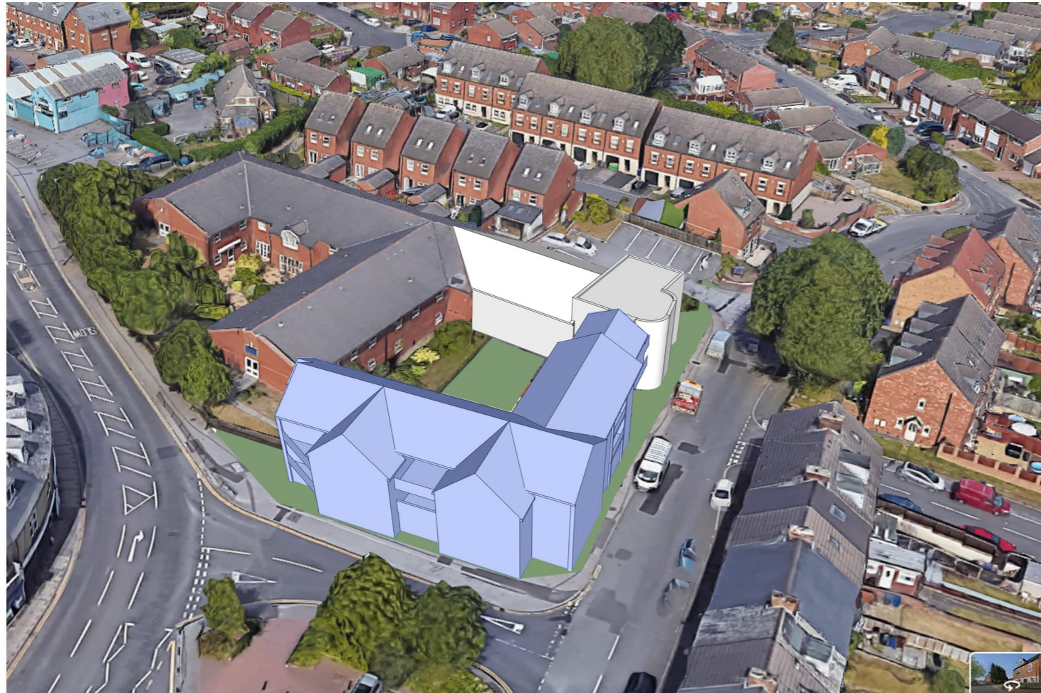
Total proposed mass of the 12 proposed apartments (shown in blue) and the proposed carehome extension (under separate planning application). The large mass of the existing cinema building has been reinterpreted to create a large courtyard design that is better distributed over the site. The pitched roof of the proposed will feel considerably smaller from a pedestrians perspective and the appearance of the proposed will give a more appealing outlook to the houses on Market place and Belle green lane. Lastly the view from the carehome windows will be less oppressive and brighter.