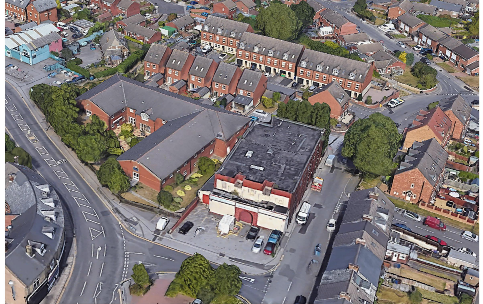
Existing 2024 google map aerial image. The large rectangular design of the old cinema building no longer fits amongst its residential surroundings and sits tight to the street.