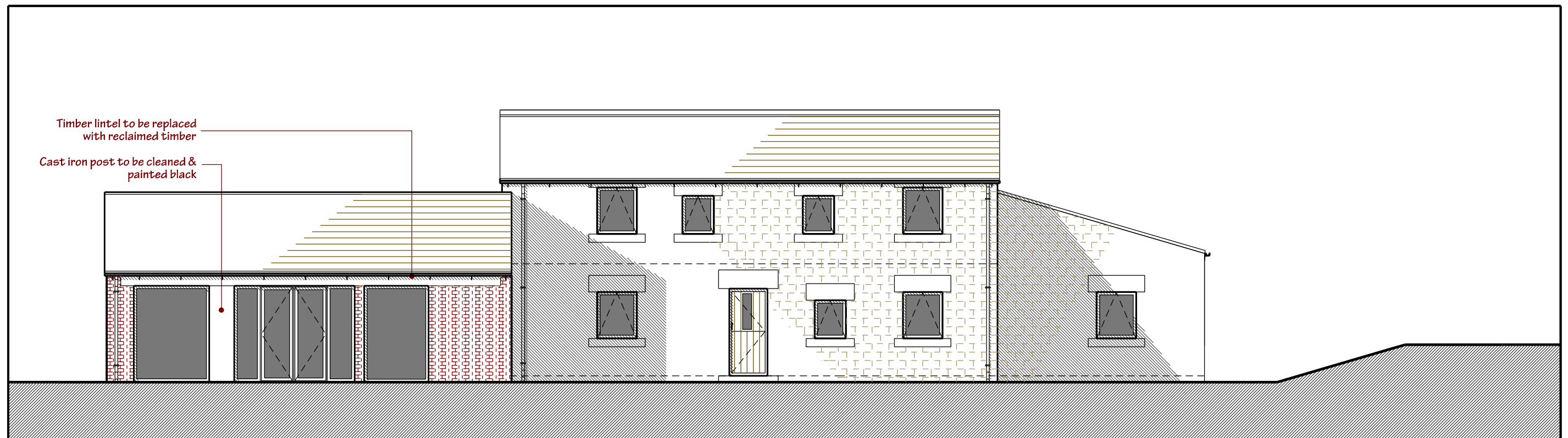
Barn B, South Elevation - Proposed

Timber lintel to be replaced with reclaimed timber Cast iron post to be cleaned & painted black