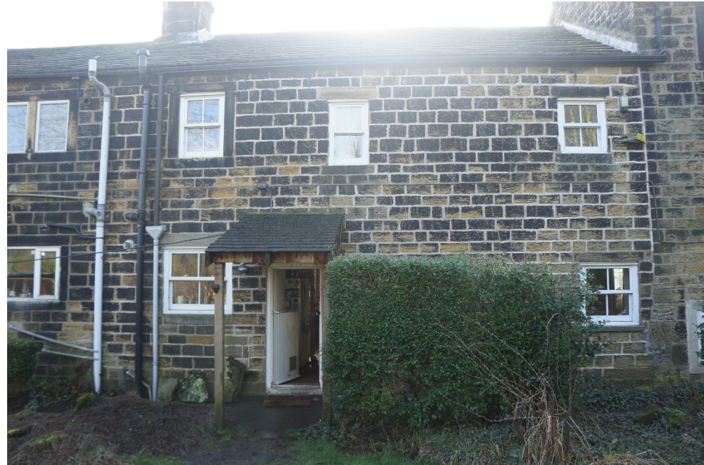
7 Ingbirchworth Road Photo - Rear