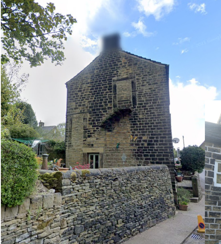
9 Ingbirchworth Road Photos