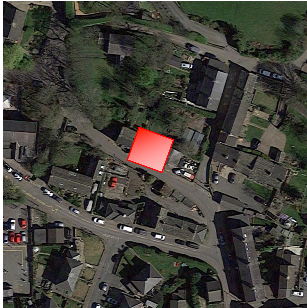
Aerial Photo of Site

Historic Environment Good Practice Advice Planning Note 3: The settings of Heritage Assets, published by Historic England.