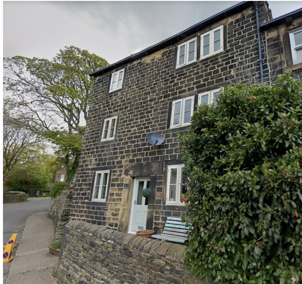
9 Ingbirchworth Road Photo