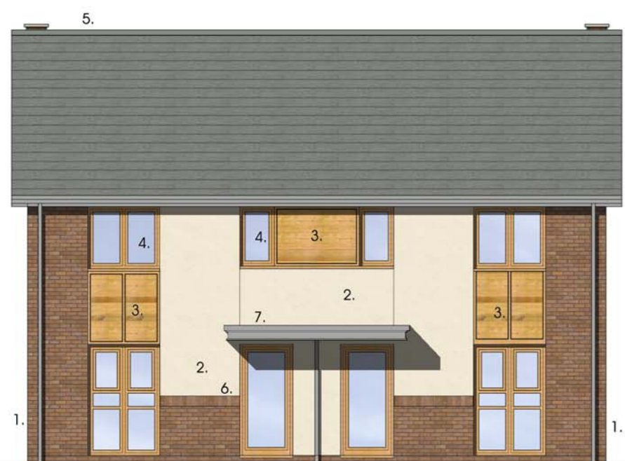
Entrance Elevation Simple Pitched Roof Option