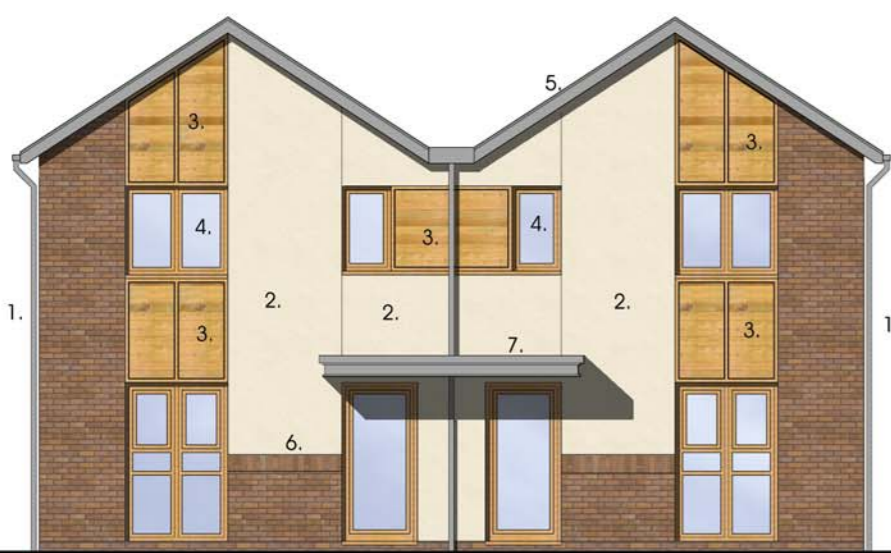
Entrance Elevation Gable to Street Option