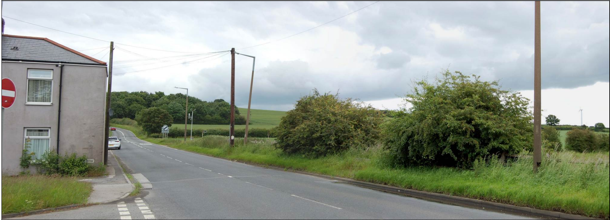
Photographic Viewpoint 2 – B6273: Looking east from further north along the B6273 at the top corner of the site. Properties and traffic would have direct views into the site. Beyond the northern boundary, the terrain can be seen rising up to the woodland and agricultural horizon.