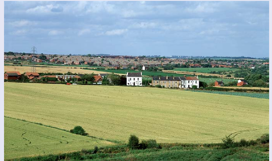
The NCA displays a mixed pattern of developed areas and farmed, open countryside.