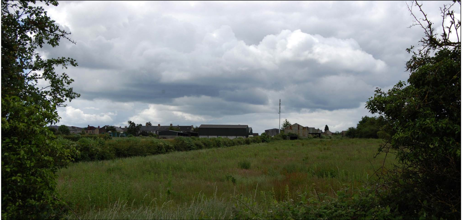
Photographic Viewpoint 4 – Public Footpath: Looking south into the site through one of various gaps in the hedge. Clear views of the farm buildings to the south of the site can be seen. These gaps should be infilled and allowed to grow out to its natural form.