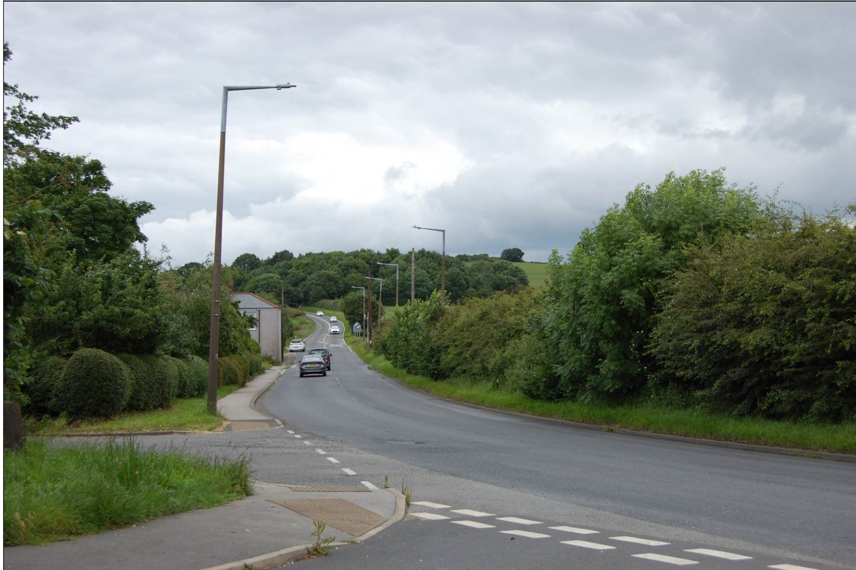
Photographic Viewpoint 1 – B6273: Looking north-east along the B6273, this represents views obtained by motorists and properties located along this road. The existing hedge along the western site boundary is clearly visible and screens views into the site behind. This hedge is to be removed to allow construction of a pedestrian footpath but will be replaced with a native hedge and specimen tree planting, creating an attractive green edge to the site.