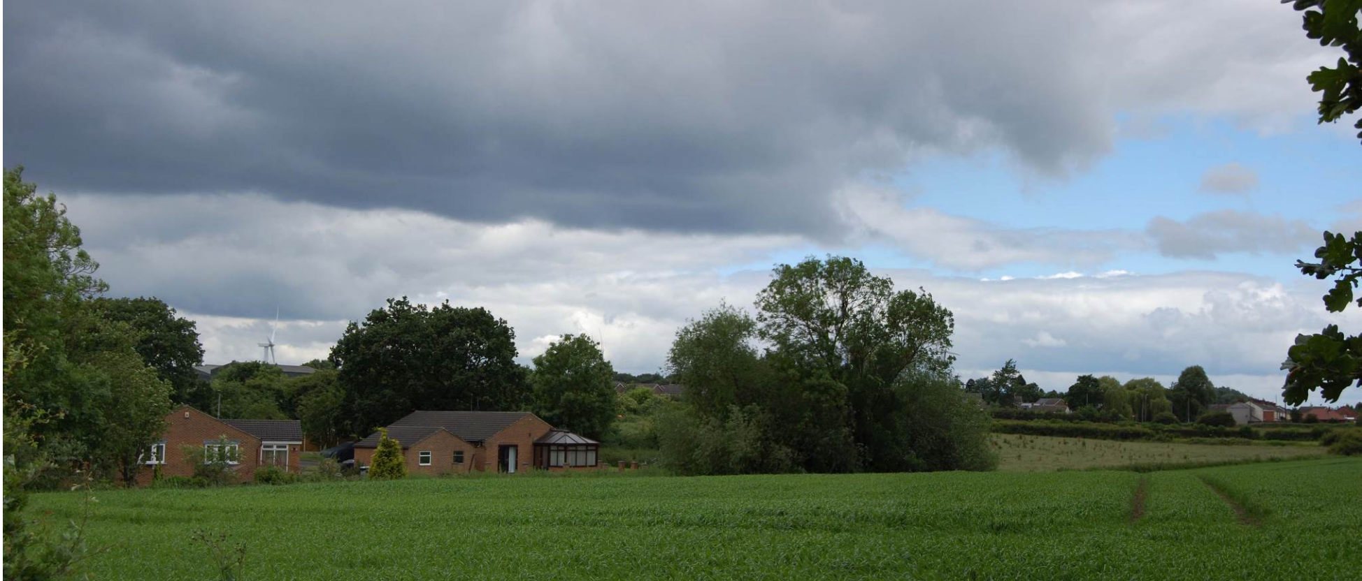
Photographic Viewpoint 7 – Public Footpath: Looking west from further along the public footpath towards the site. The two northernmost properties on Garraby Close can be seen to the left of the view with surrounding vegetation offering some screening effect. Views from this stretch of footpath are intermittent due to mature hedgerows however those views that are obtained are elevated and open.