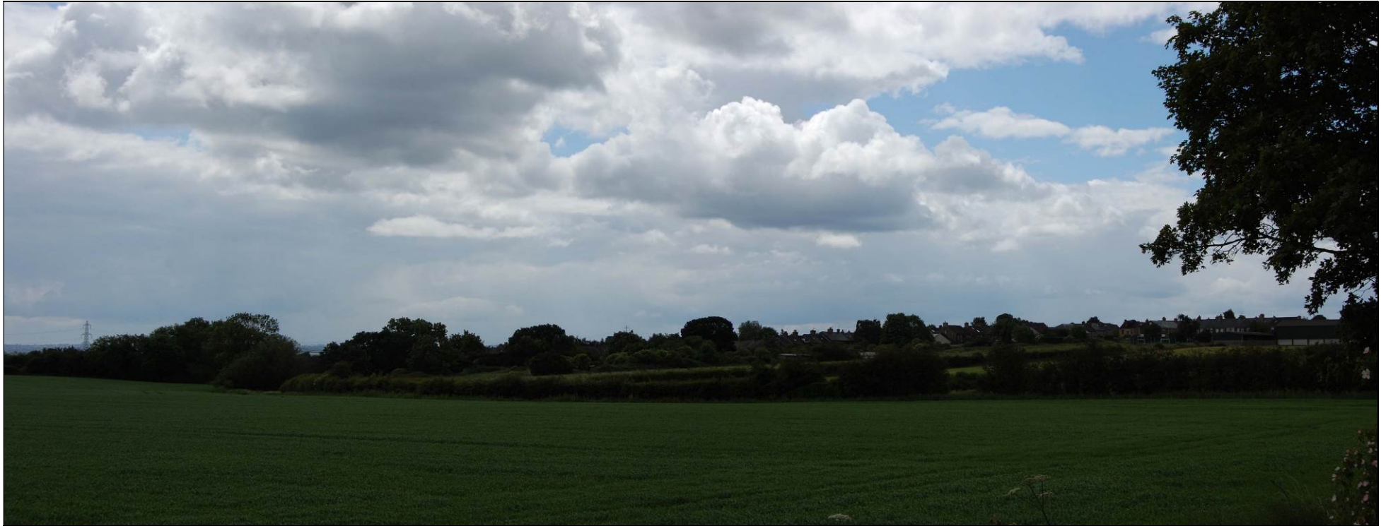
Photographic Viewpoint 5 – B6273: Looking south from the B6273. The mature boundary hedgerows are visible from this stretch of road. The proposals would be seen in conjunction with existing dwellings within Great Houghton and below the skyline. Mitigation planting would create a strong green edge to the village and screen some views of the proposed dwellings.