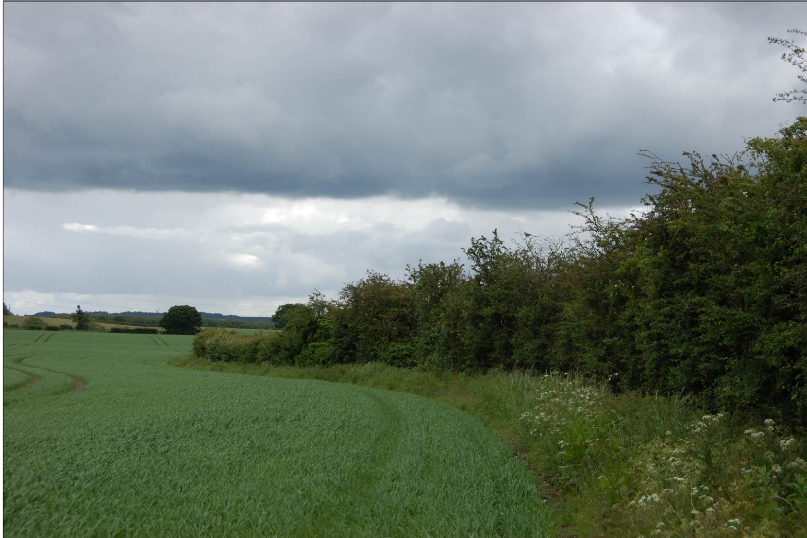
Photographic Viewpoint 3 – Public Footpath: Looking south-east from where the footpath leaves the B6273. The existing mature Hawthorn hedge can be seen along the northern boundary of the site. This provides an excellent screen. Some gaps are evident in the hedge (see Photographic Viewpoint 4) which should be infilled and allowed to grow out to its natural form (in excess of 4m).