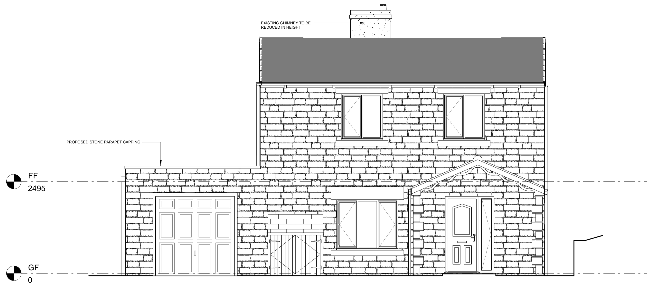
Proposed South East Elevation 1 : 50