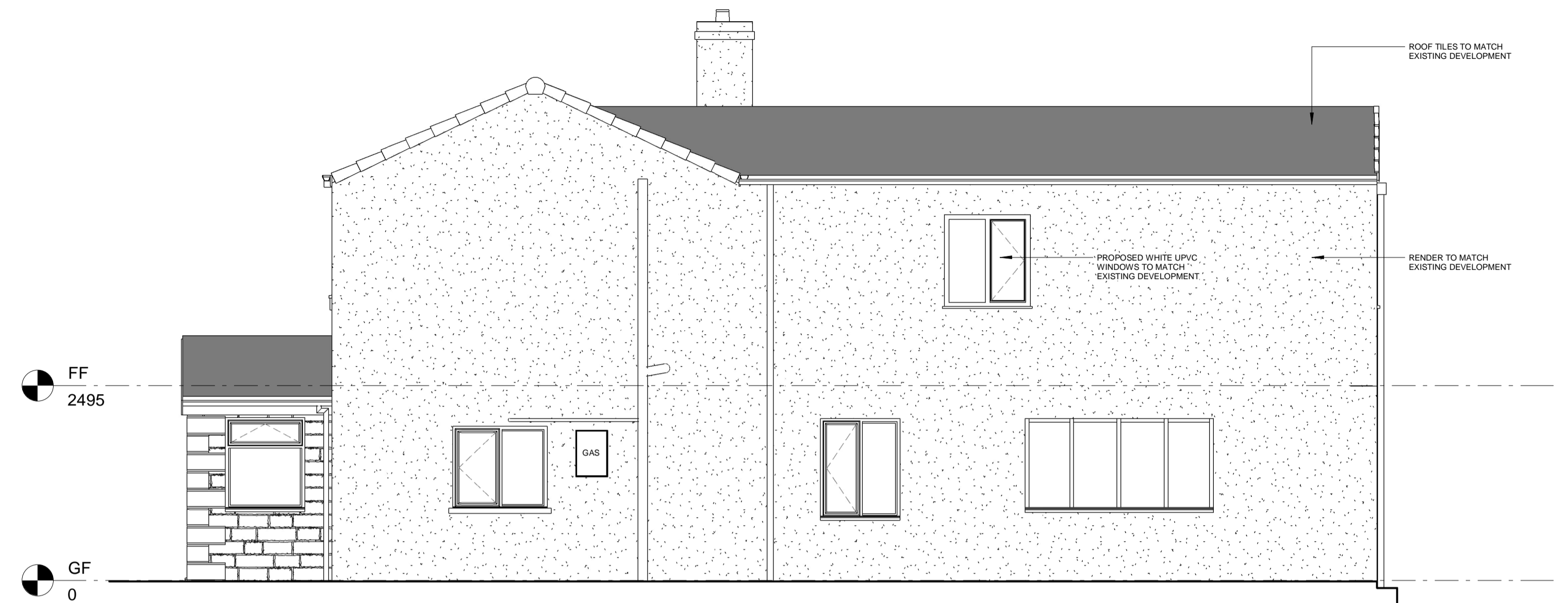
Proposed North East Elevation 1 : 50