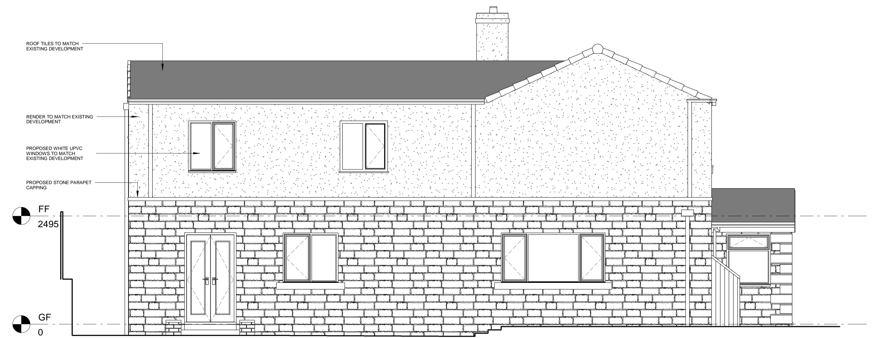
Proposed South West Elevation 1 : 50