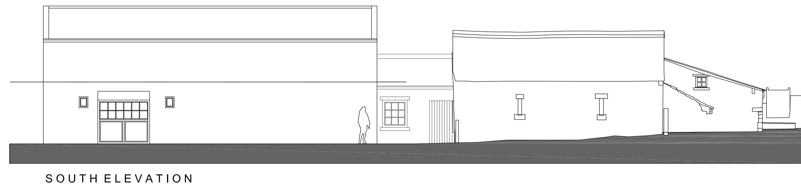
EXISTING ELEVATIONS TO COURTYARD (Unchanged)