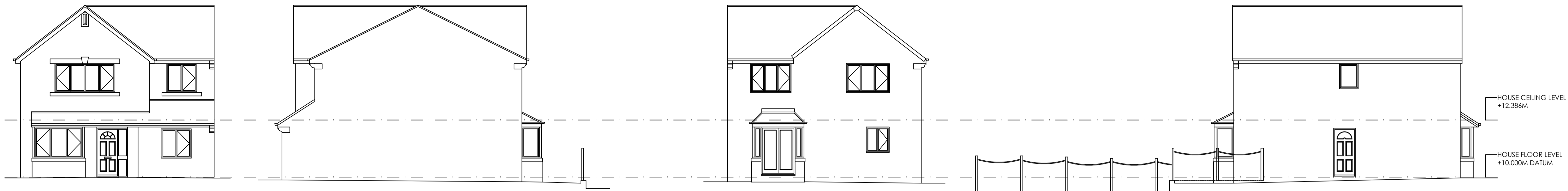
ORIGINAL FRONT ELEVATION SCALE 1:100