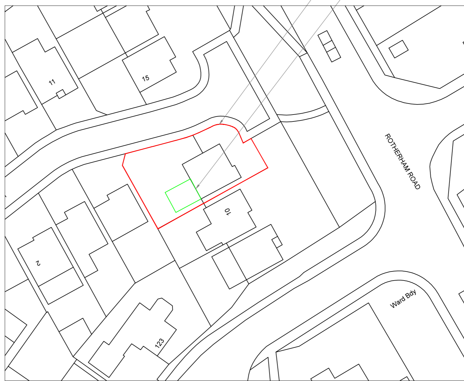
SITE PLAN SCALE 1:500 AT A3