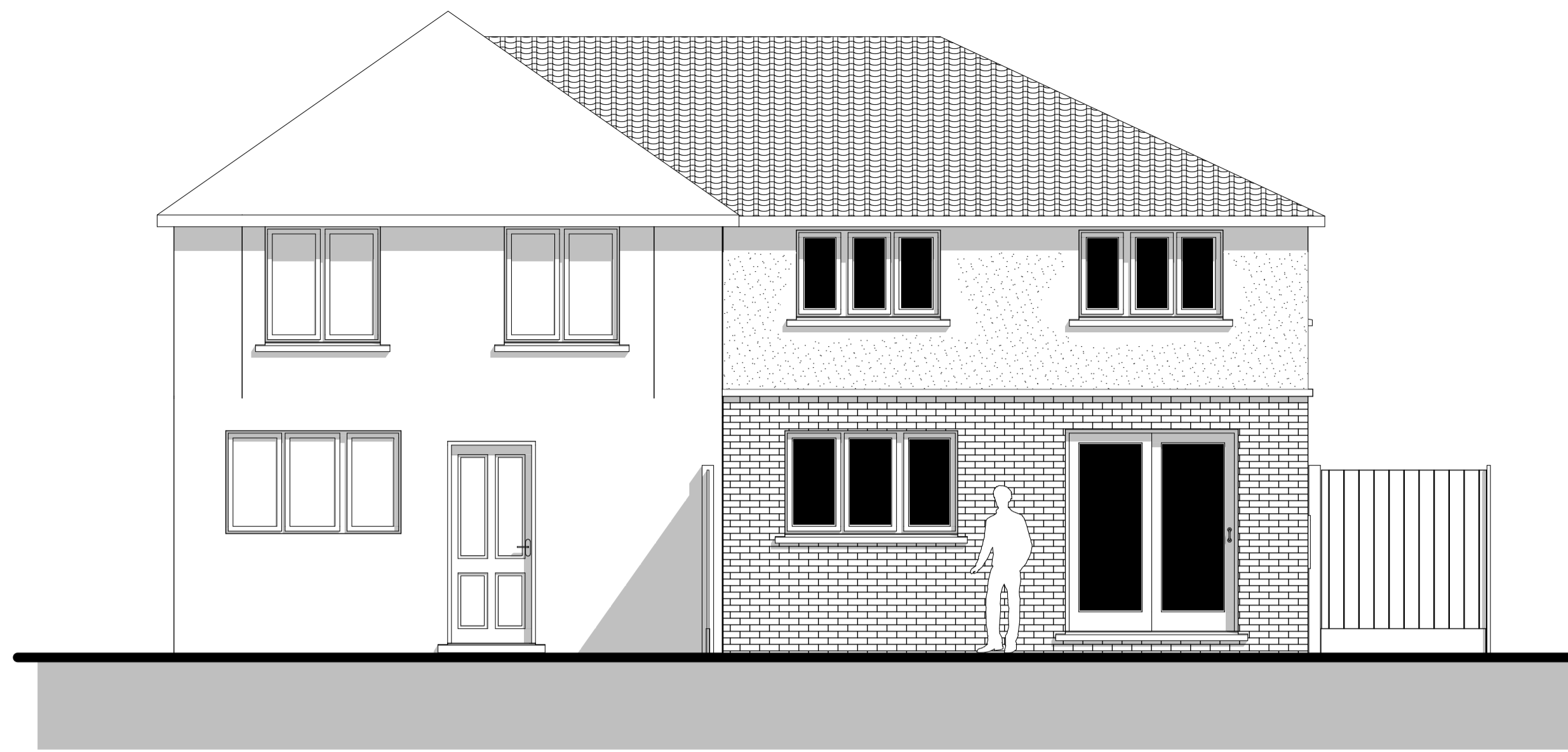
A-6 Elevation (1) 1:50