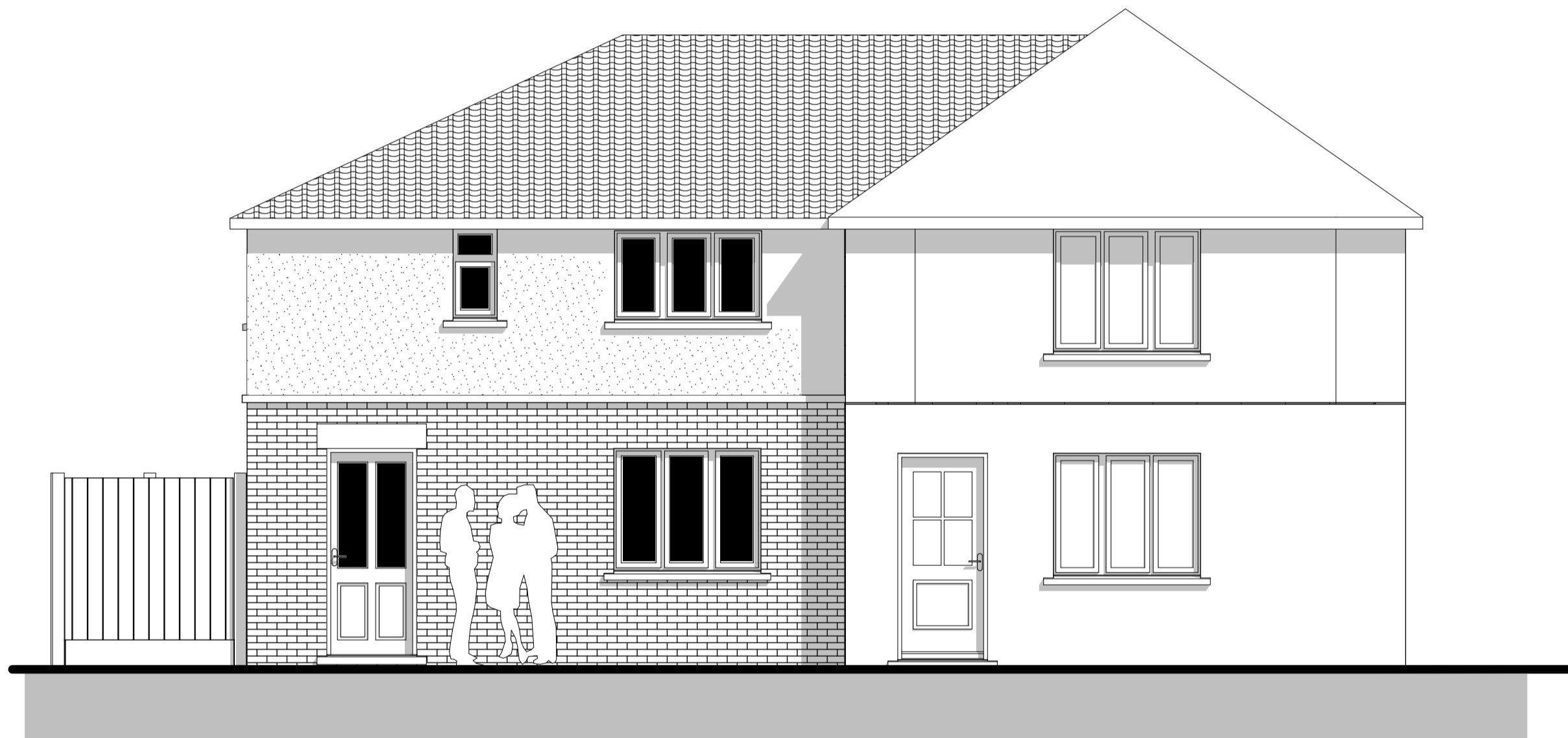
A-9 Elevation (1) 1:50