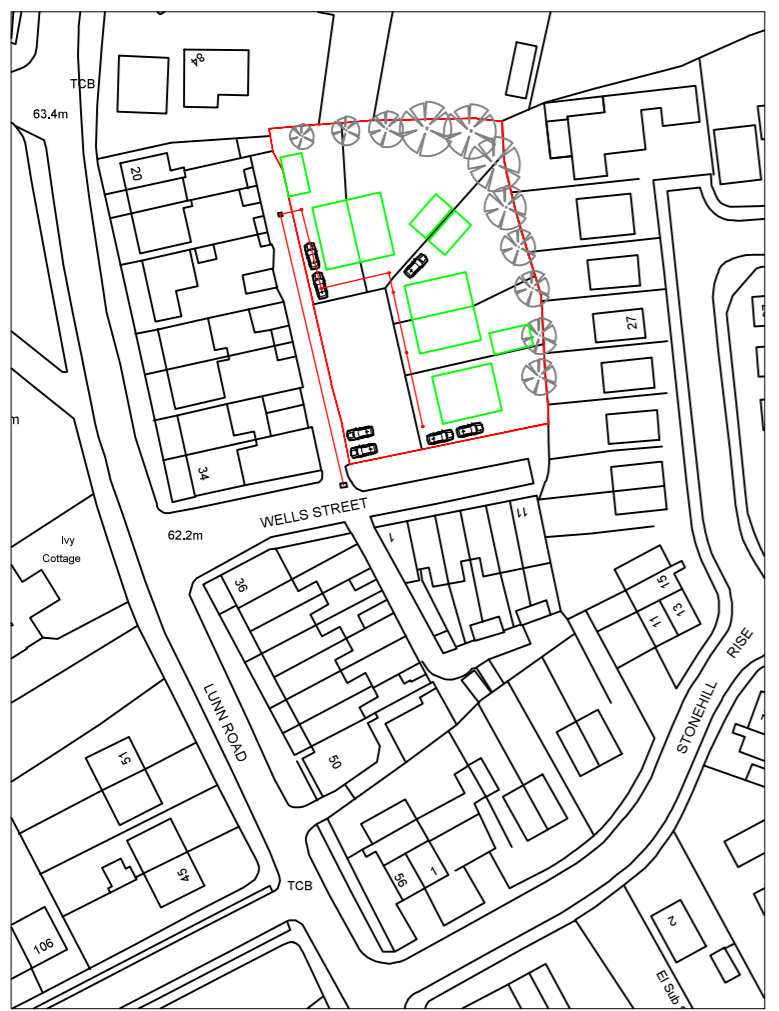
LOCATION PLAN SCALE 1:1250 AT A3