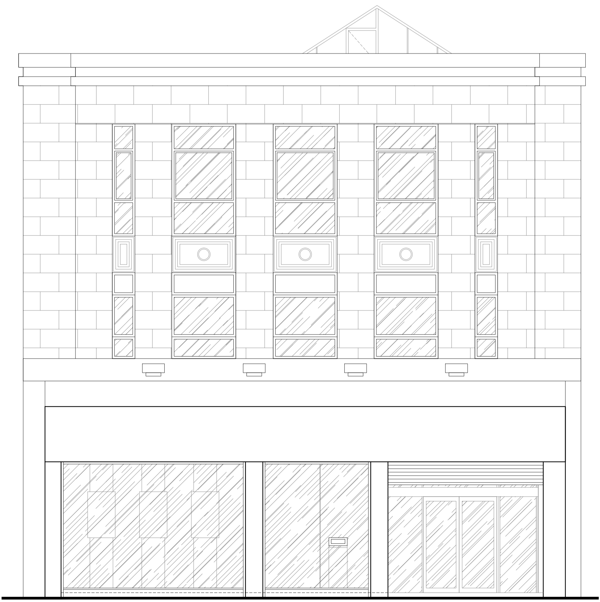
SHOPFRONT AS EXISTING scale 1:50@A1