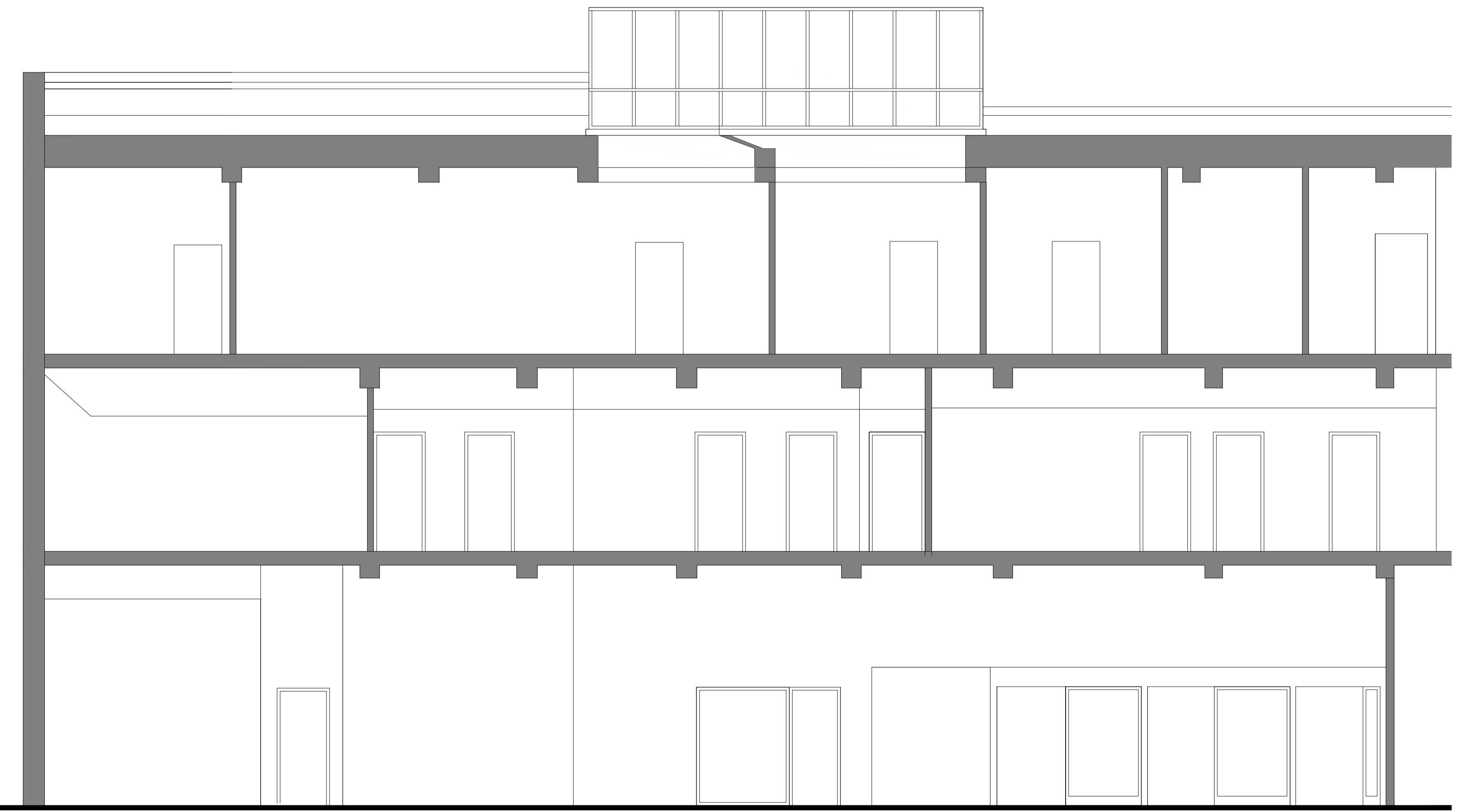
PART SECTION THROUGH BUILDING AS EXISTING scale 1:50@A1