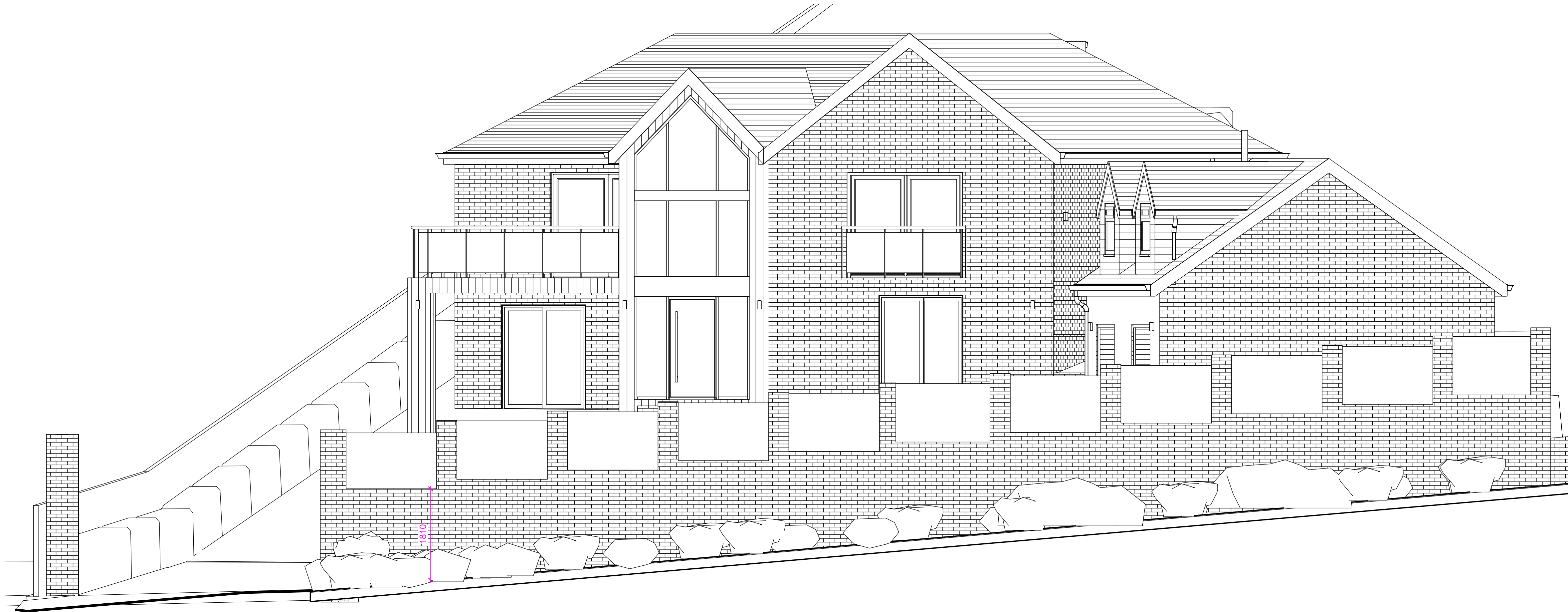
3 PROPOSED SECTION OF SUPPORTING WALL 1 : 50