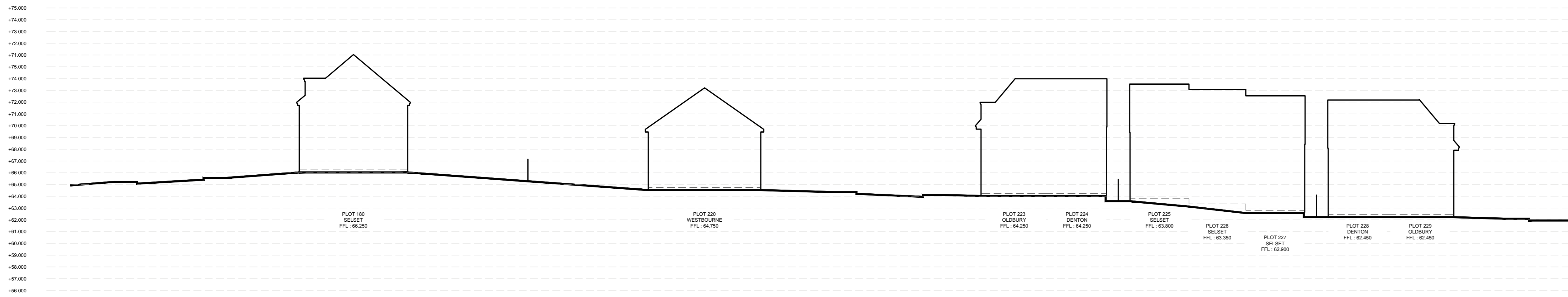
SITE SECTIONS 2-2