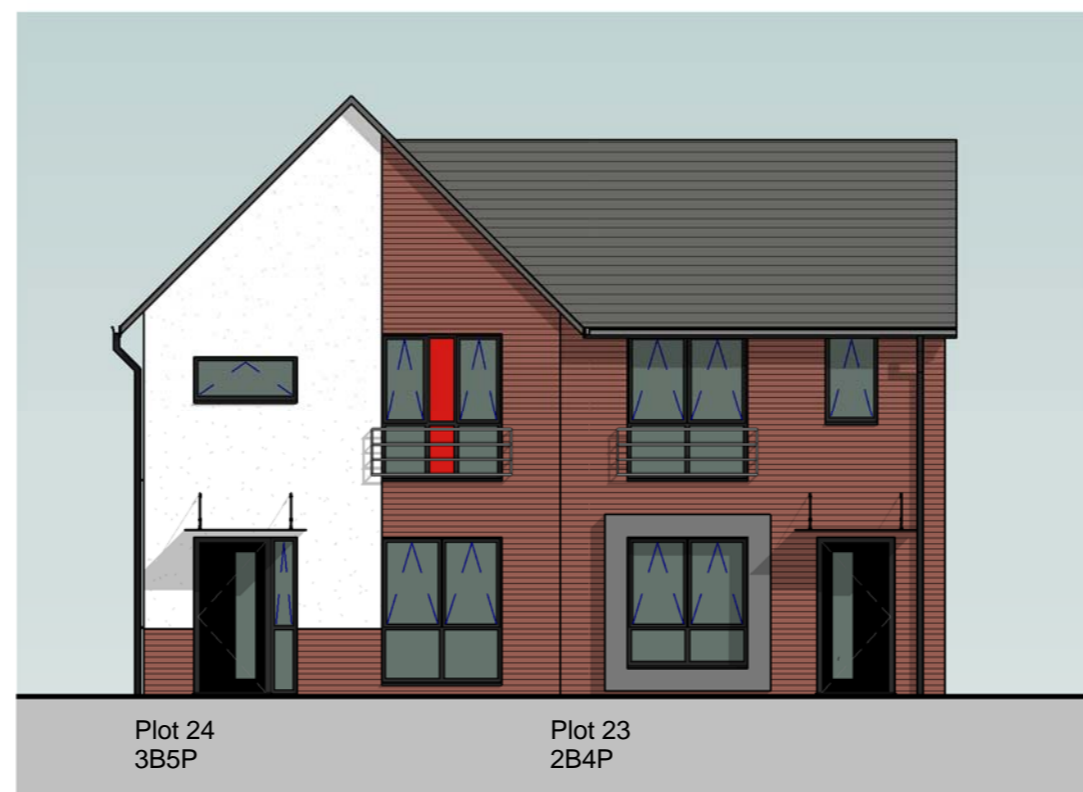
Front / West Elevation 1 : 100