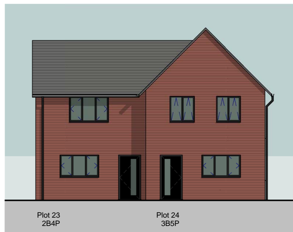
Rear / East Elevation 1 : 100