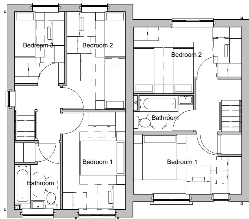
Plot 24 3B5P Plot 23 2B4P