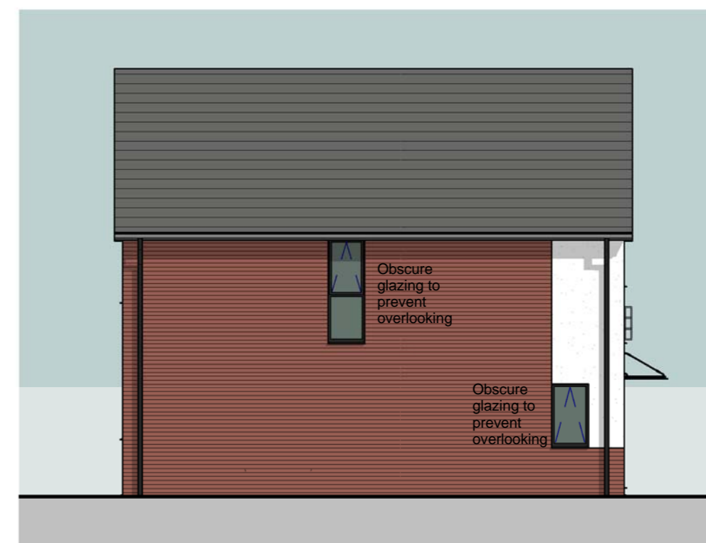
Plot 24 Side / North Elevation 1 : 100