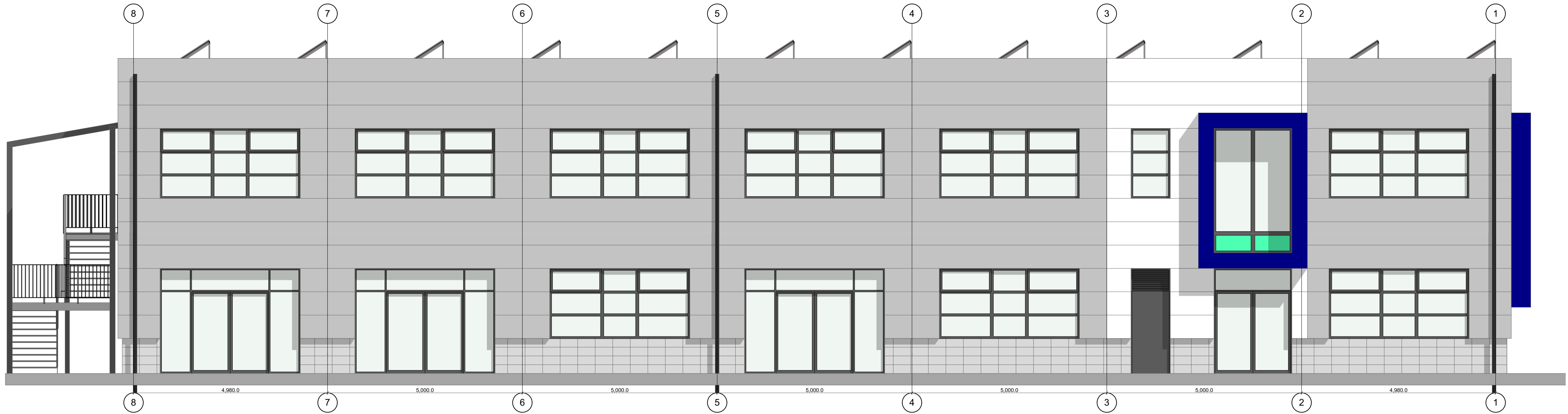
East Elevation 1:50