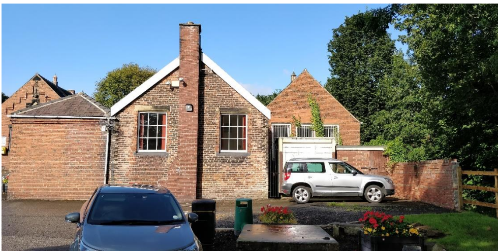
Existing East elevation of St John's Community Centre

The works will involve the extension of the community centre via an infill to the North-East corner (see below behind white container). The new accommodation will include a new external stepped and ramped fire escape.