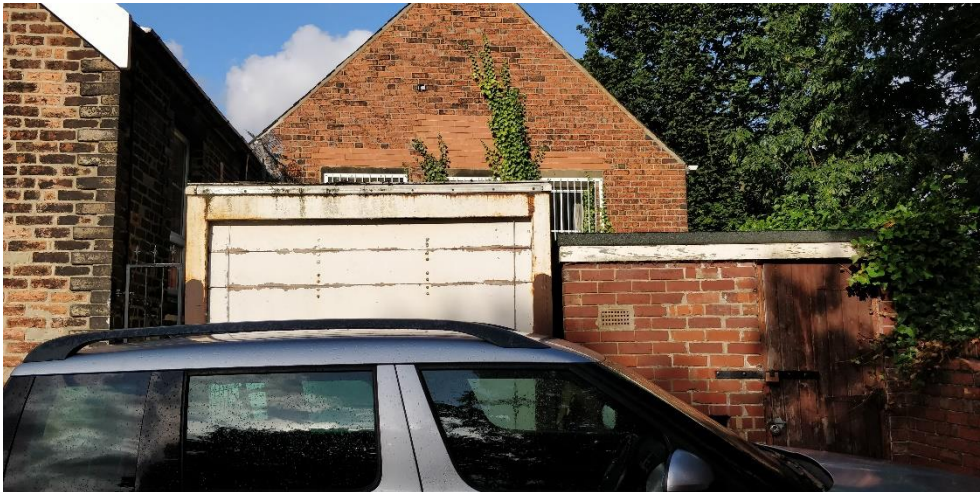
Detail of Existing Recessed Rear East elevation of St John's Community Centre

The extension will be formed onto the existing Archives Room, utilised by Penistone Archive community group and will provide additional space for the publicly accessible archives. As part of the works, part of the existing façade (see photo below) will be removed to open the existing Archives room up to the new extension.