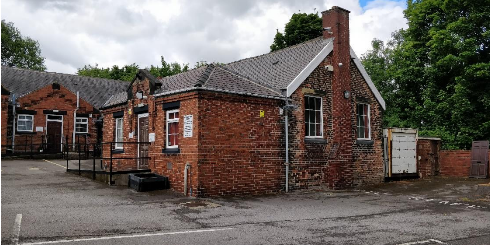
Existing East elevation of St John's Community Centre

Heritage Impact Assessment to accompany application for full planning permission at St John's Community Centre, Church Street, Penistone, Sheffield, S36 6AR.