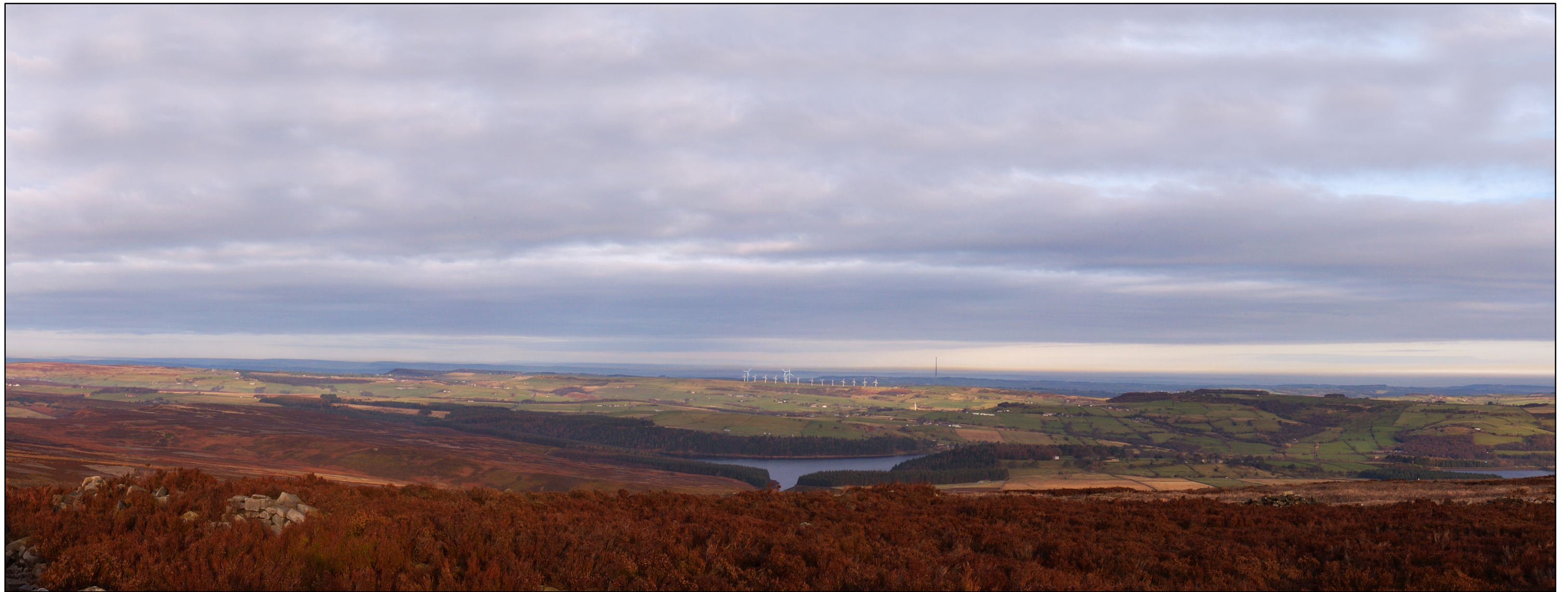
Photomontage showing proposed development from viewpoint