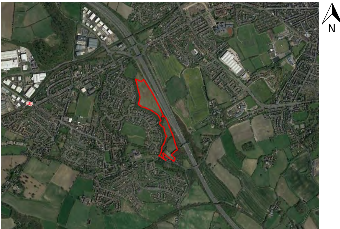
Figure 1. Site area outlined red (aerial imagery dated 2021)