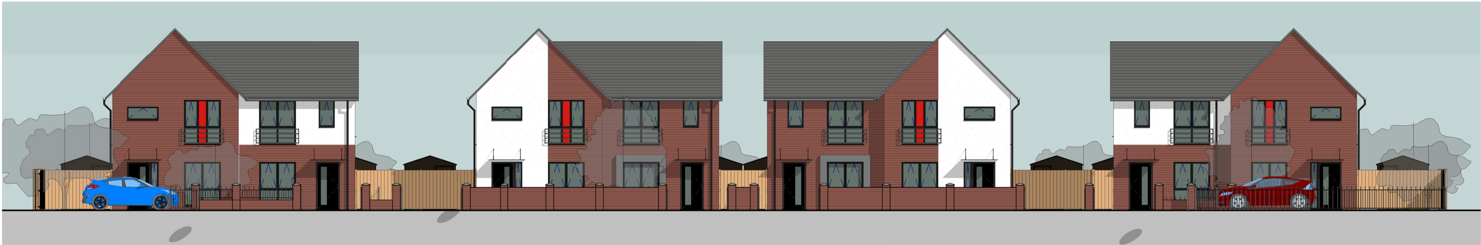
Section 6 - Plots 19 to 26 1 : 100