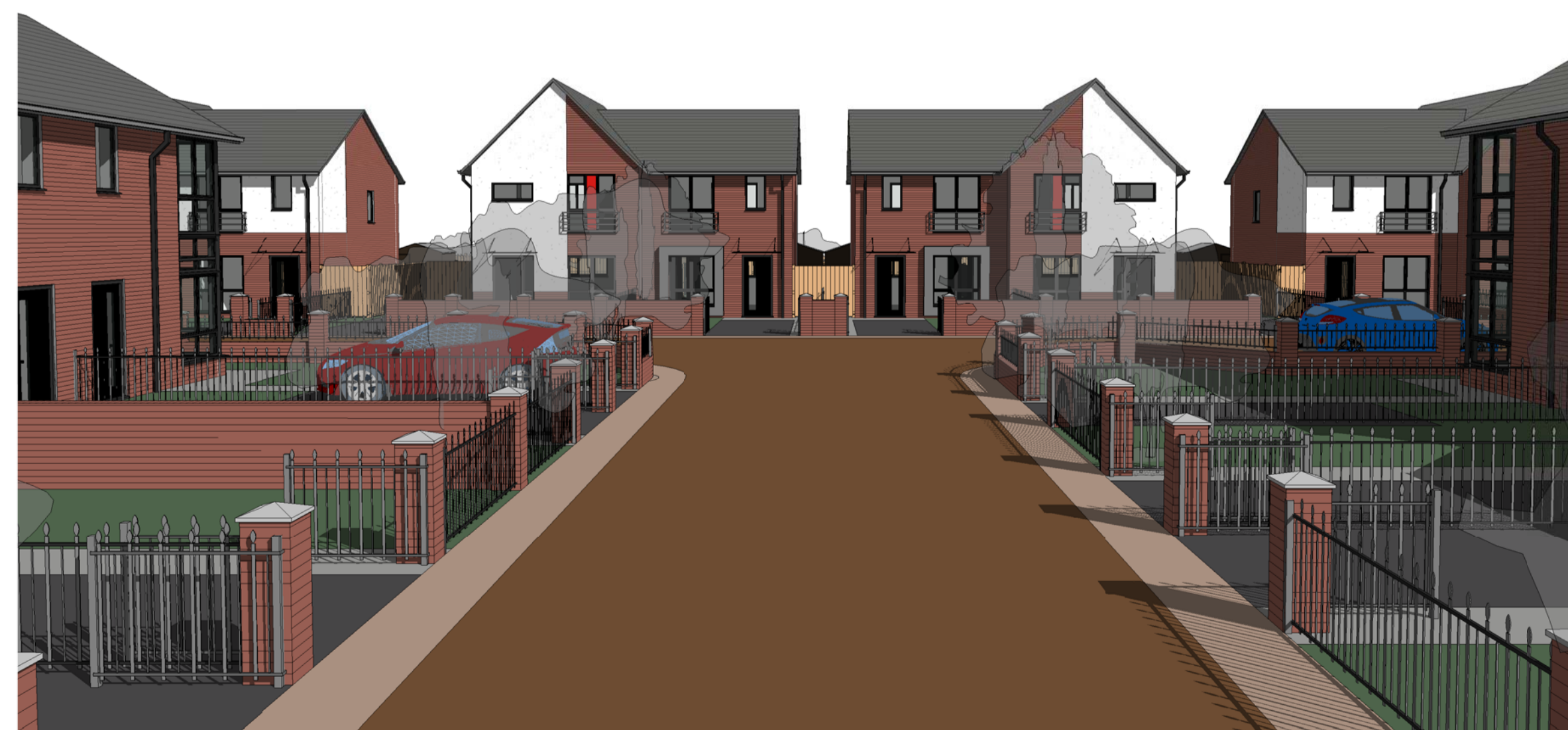
View down the Mews Court towards Plots 22 & 23