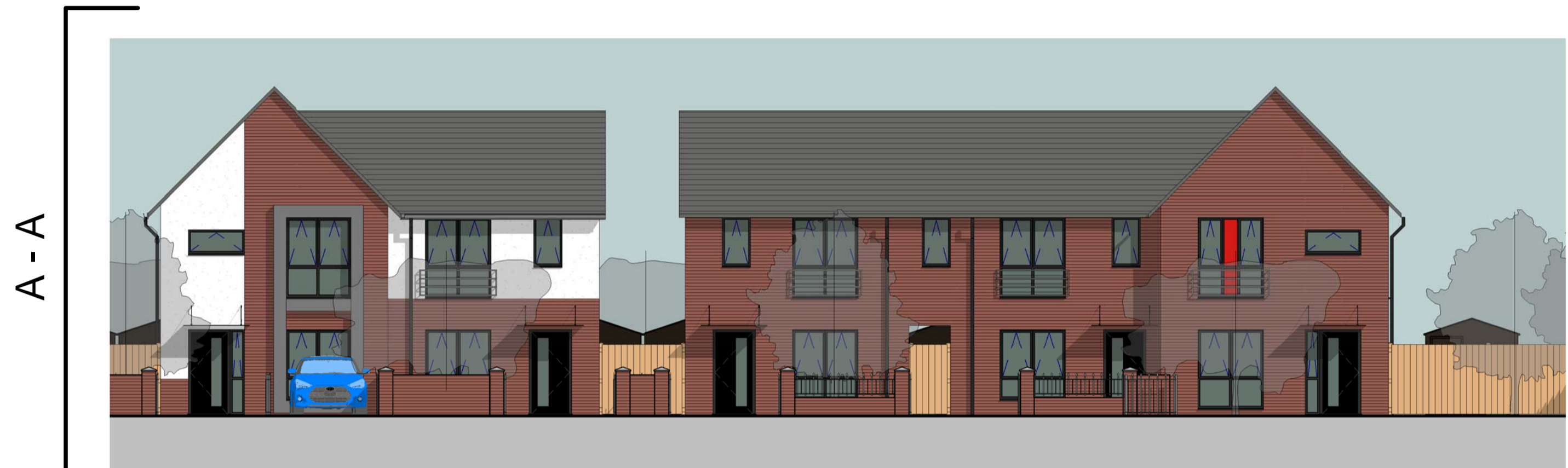
Section 5 - Plots 11 to 18 1 : 100