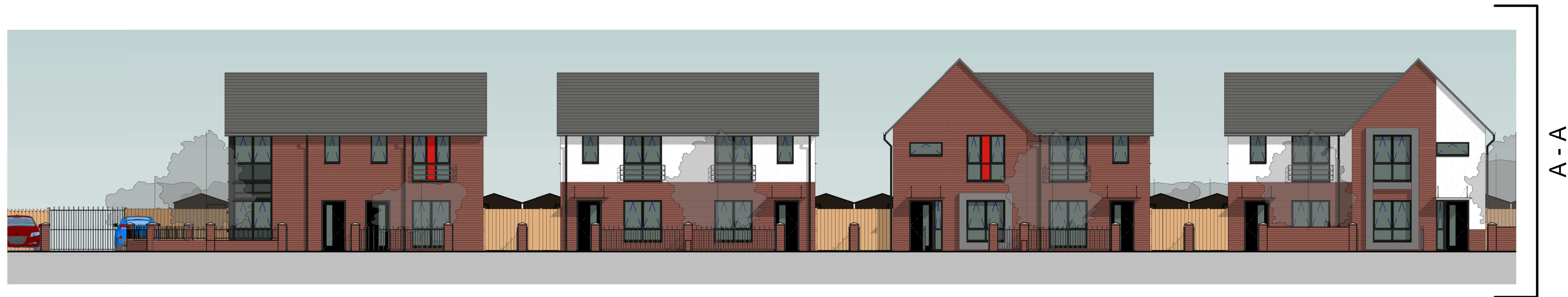
Section 4 - Plots 11 to 18 1 : 100