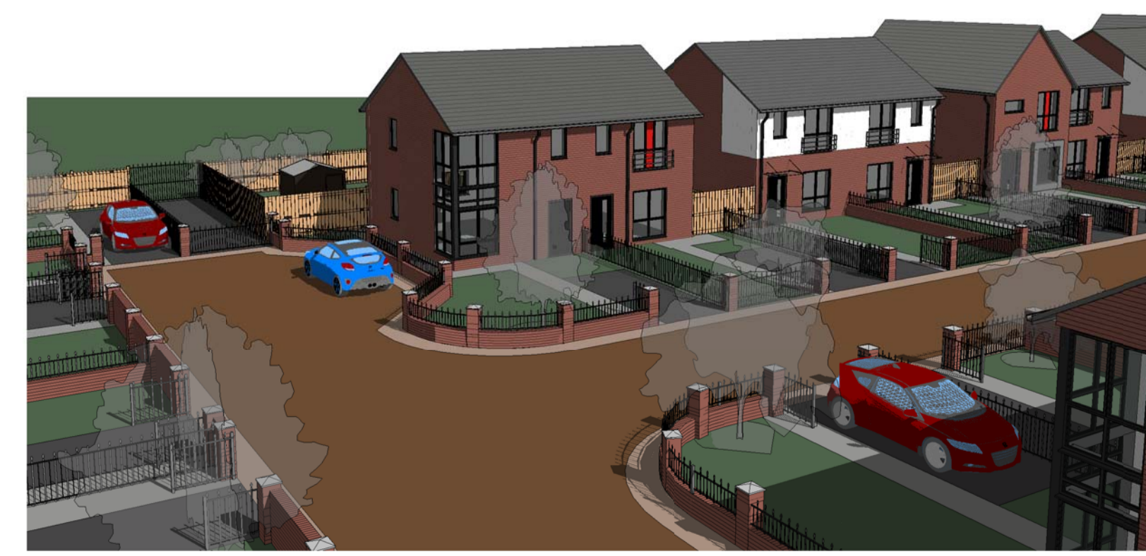
View showing the relocated access to school and Plots 17 & 18