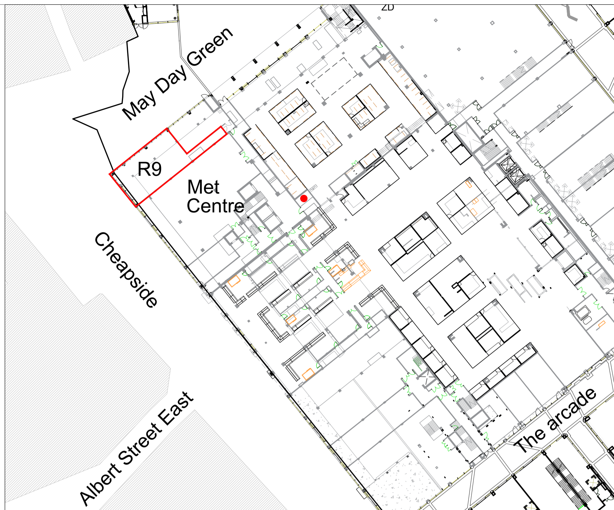
BLOCK PLAN - 1/500 Scalebar 1:500