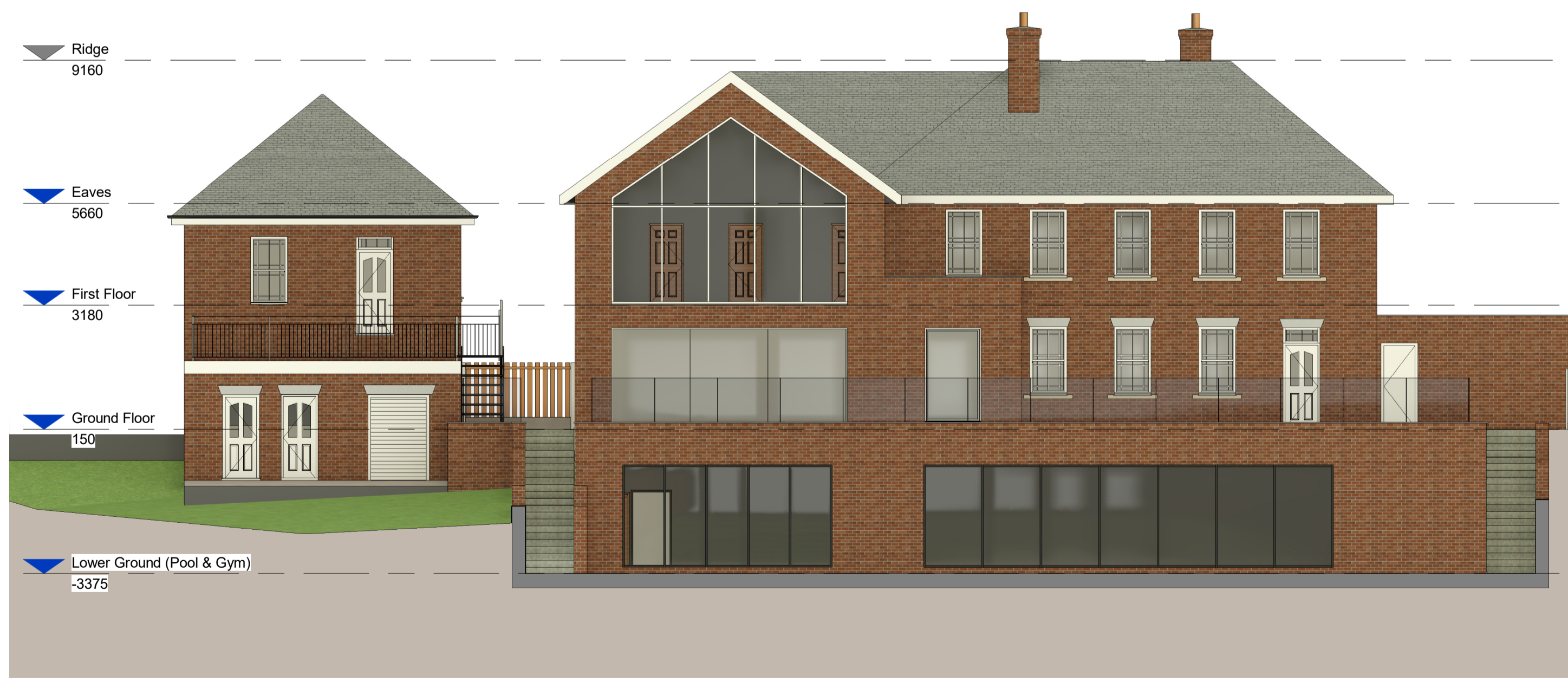
3 Proposed Rear Elevation (South West) 1 : 100