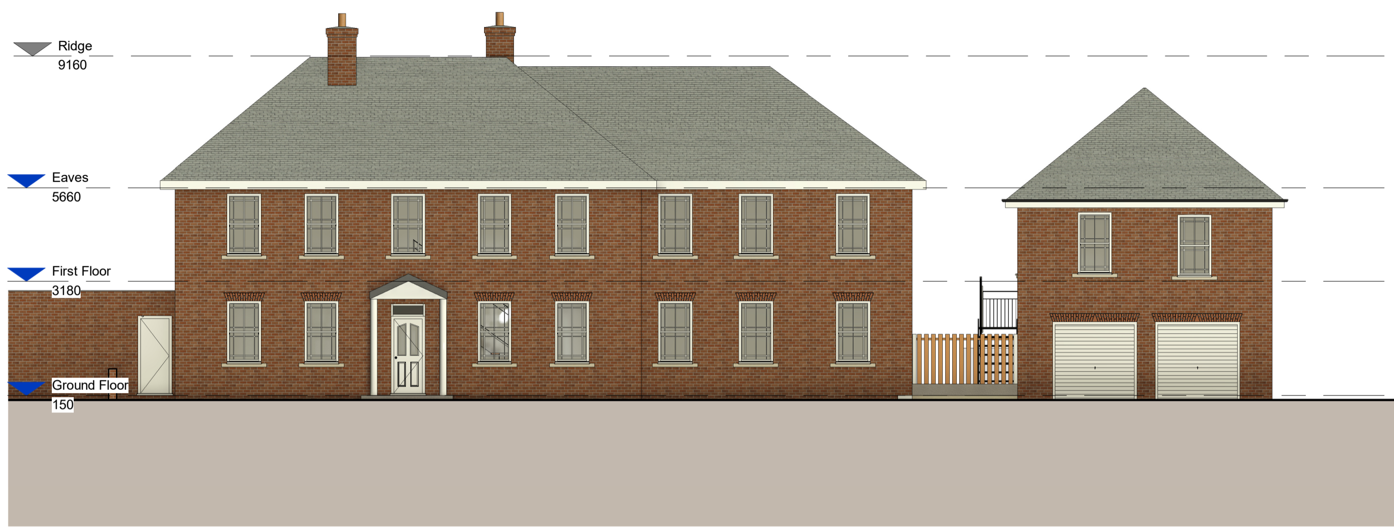
1 Proposed Front Elevation (North East) 1 : 100