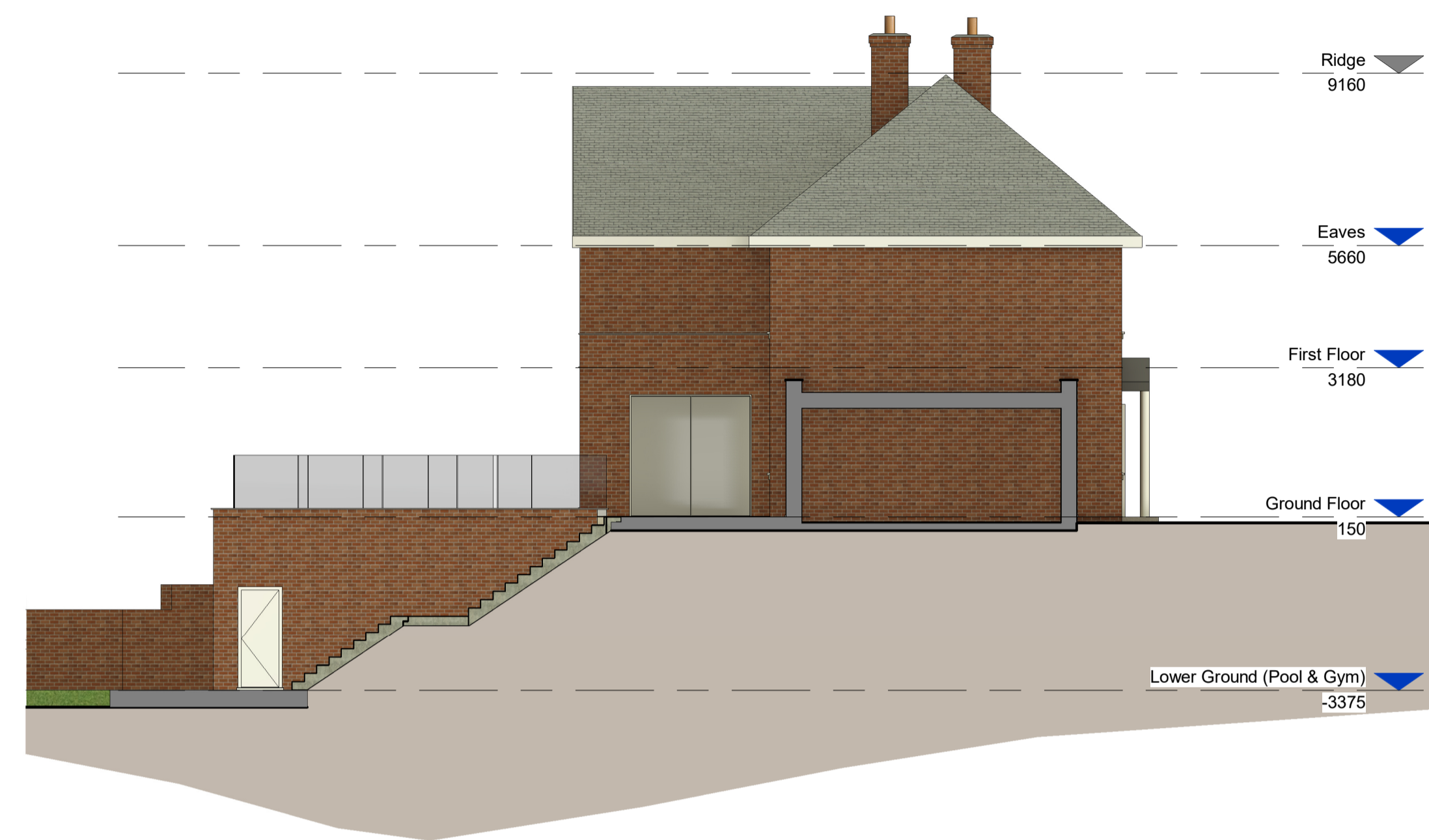
2 Proposed Side Elevation (South East) 1 : 100