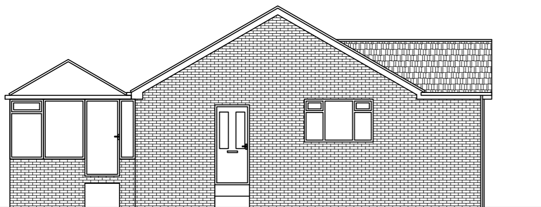
EXISTING END ELEVATION SCALE 1:100 AT A3