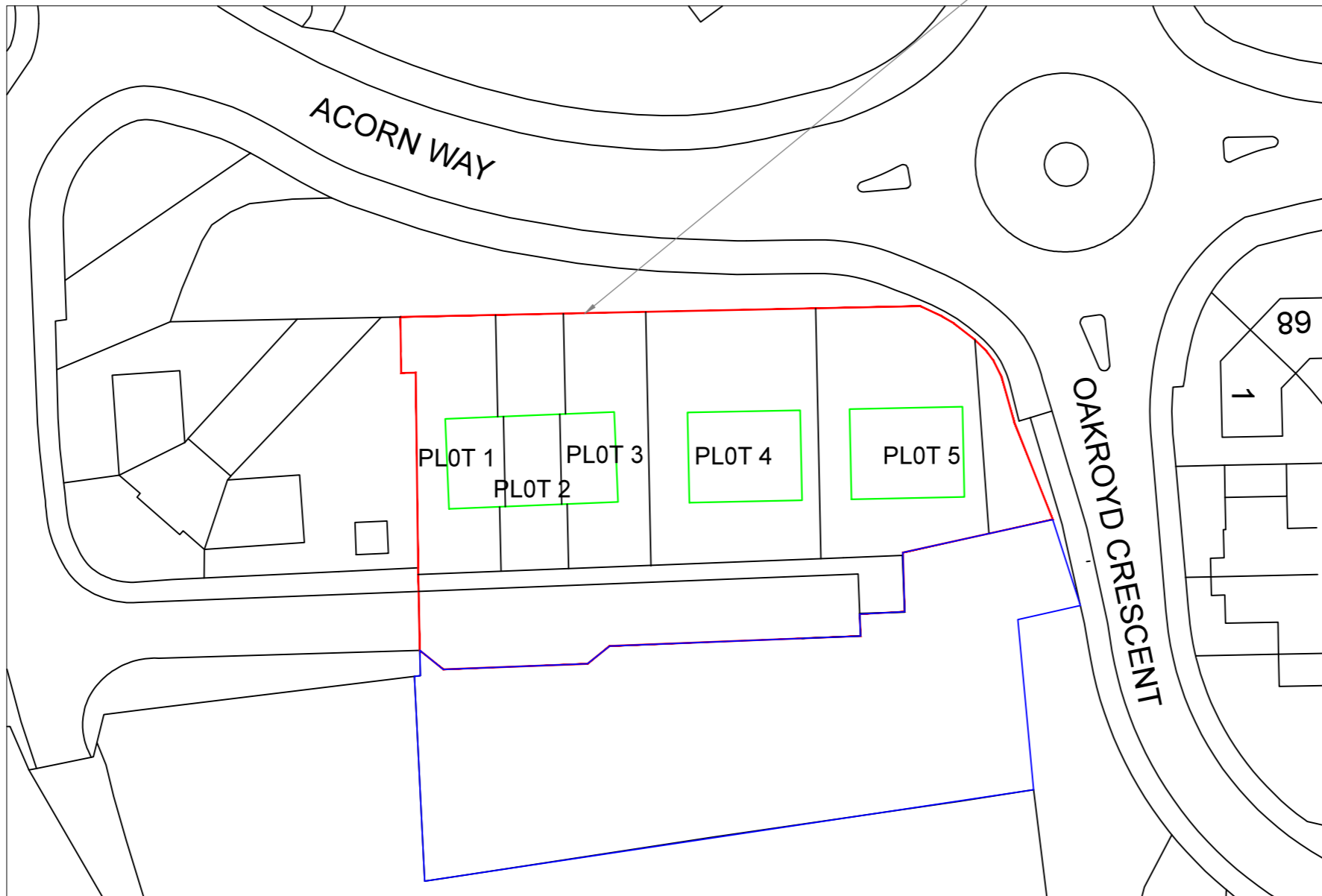
LOCATION PLAN SCALE 1:500 AT A3

DO NOT SCALE: Contractor to check all dimensions and report any omissions or errors