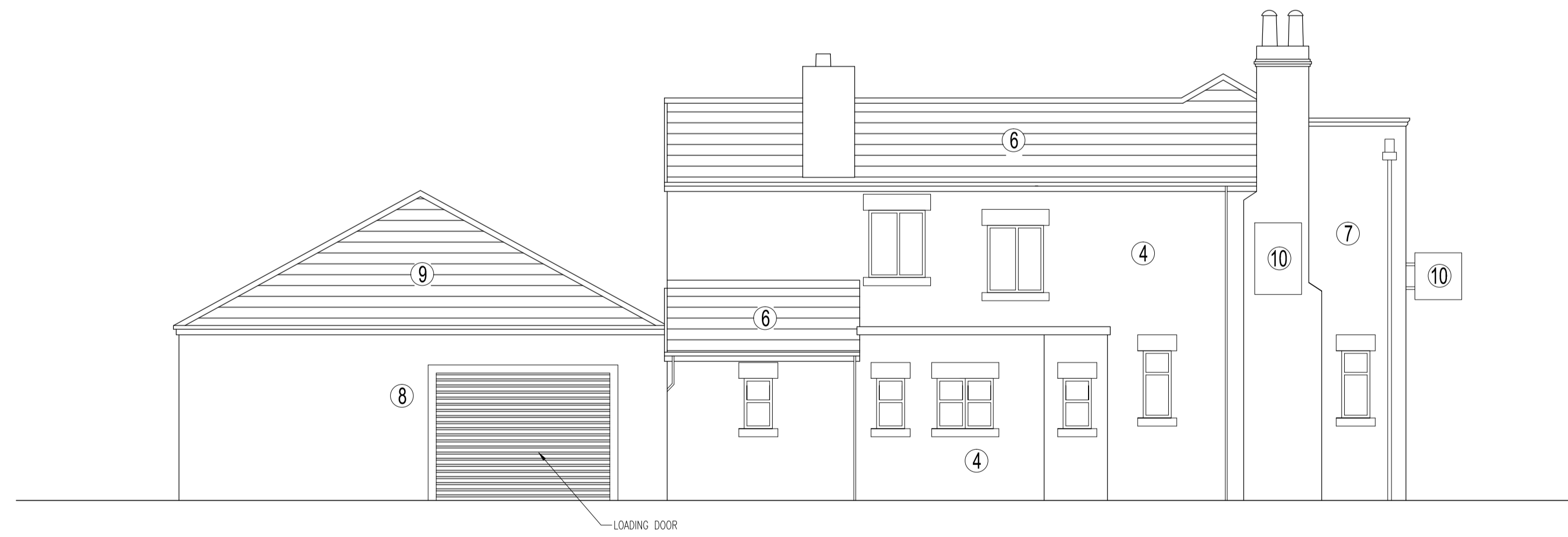
PROPOSED WEST ELEVATION SCALE 1/75