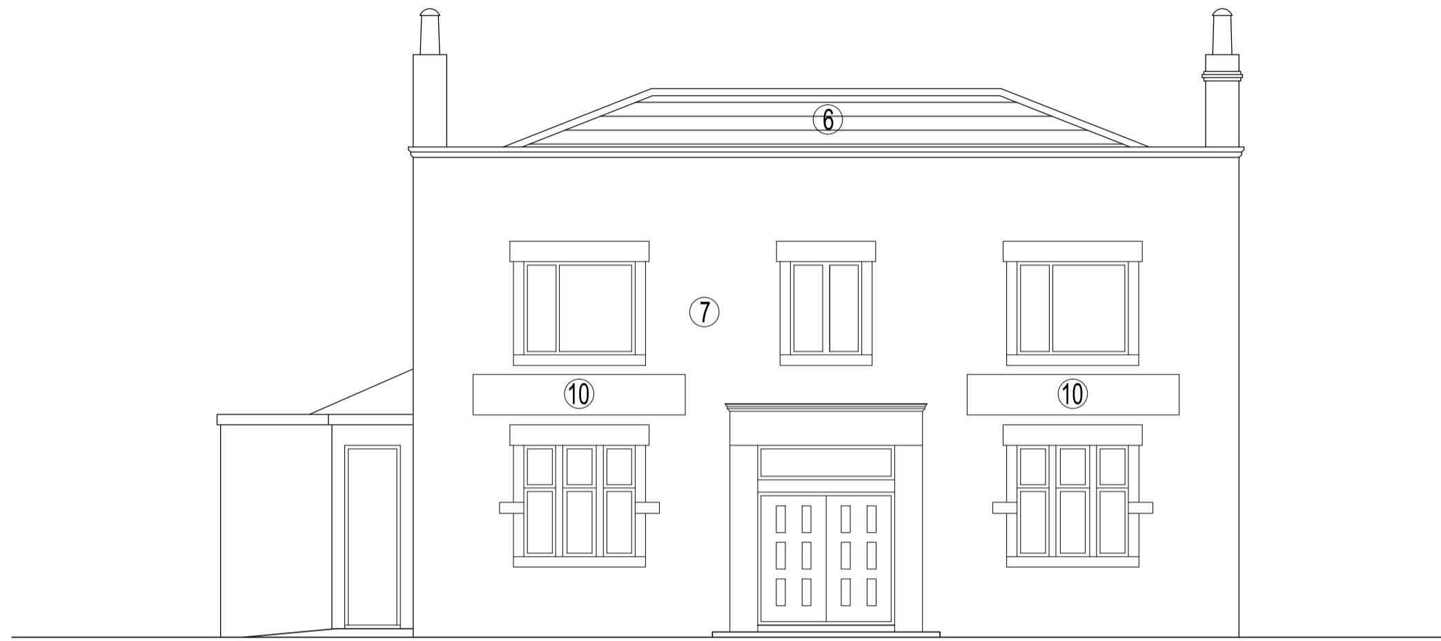
PROPOSED SOUTH ELEVATION SCALE 1/75