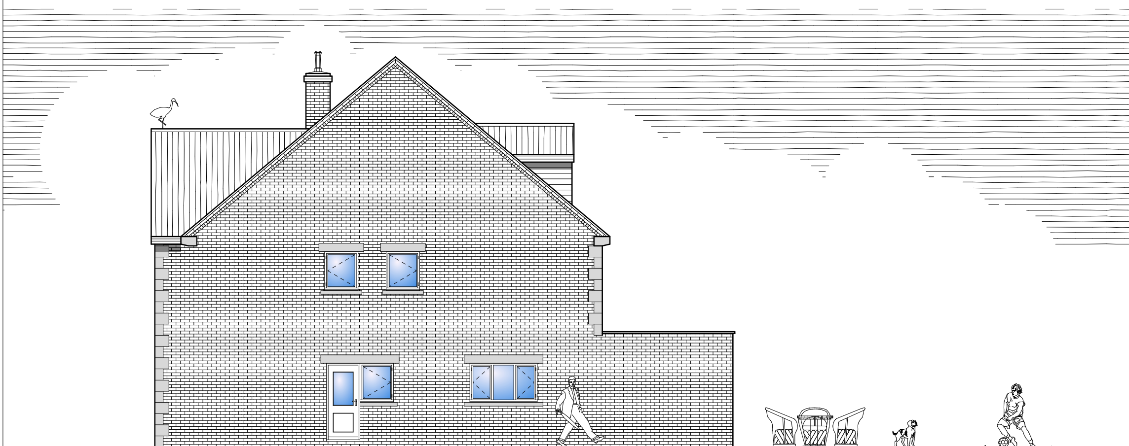
Side Elevation facing 317 Dodworth Road as Proposed.

FOR THE AVOIDANCE OF ANY DOUBT. NO WORK ON SITE IS TO COMMENCE UNTIL RESPECTIVE APPROVAL IS GRANTED / RECEIVED. ANY WORKS TO COMMENCE PRIOR TO RECEIPT OF SUCH APPROVAL, IS DONE WHOLEY AT THE CUSTOMERS RISK.