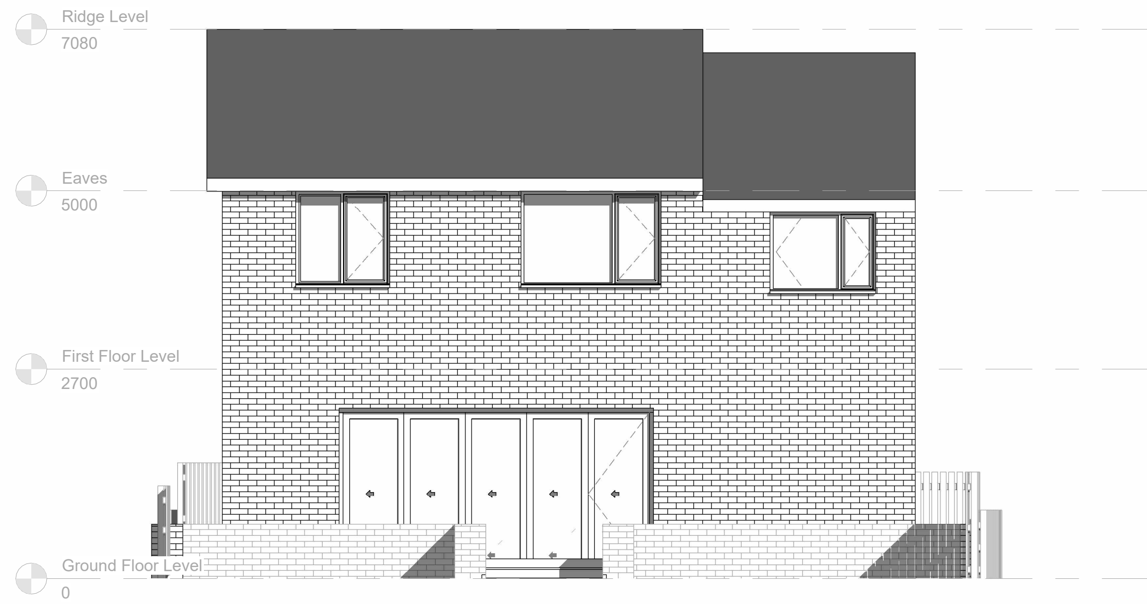
Existing East Elevation 1 : 50