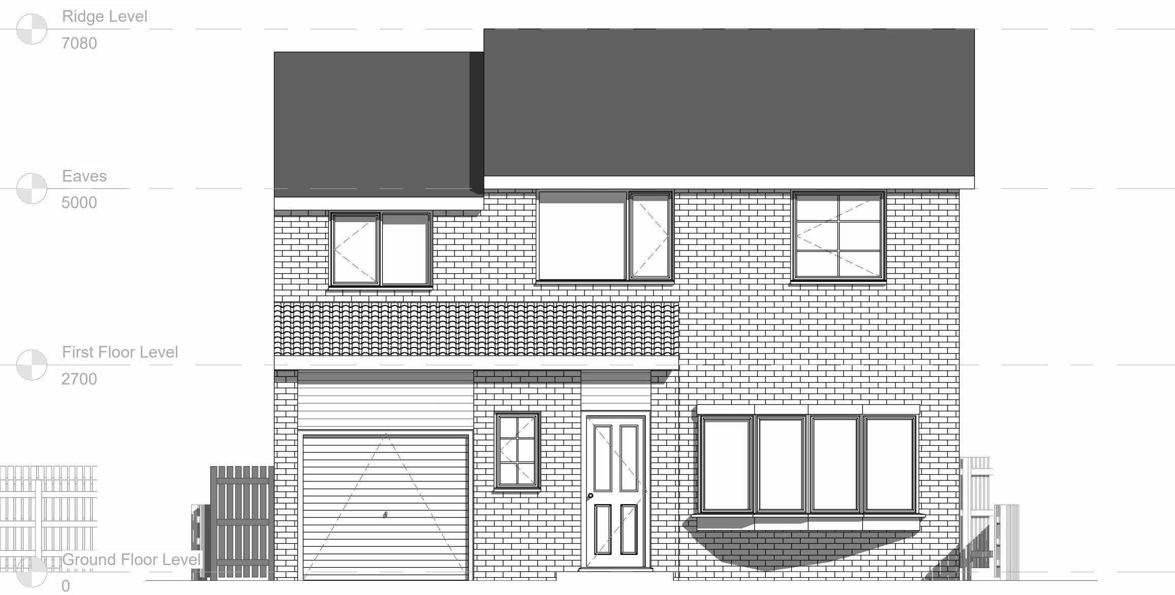
Existing West Elevation 1 : 50