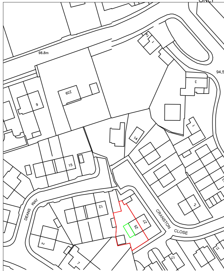
LOCATION PLAN SCALE 1:1250 AT A3