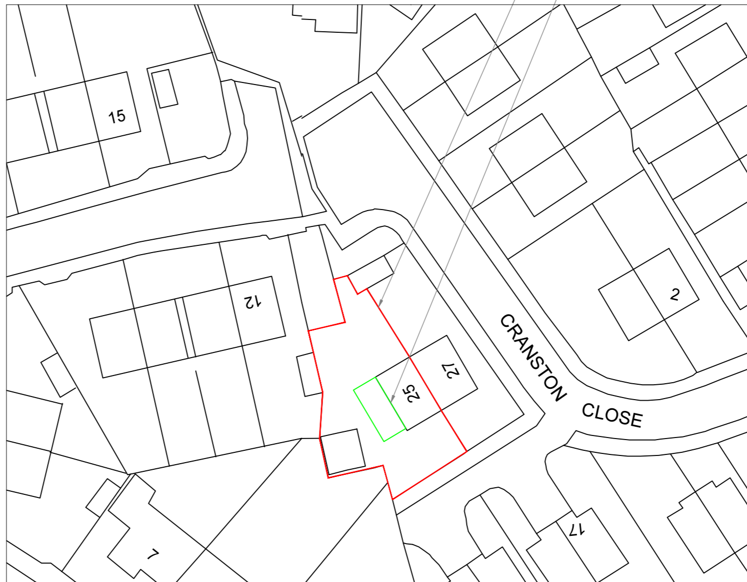
SITE PLAN SCALE 1:500 AT A3