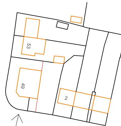
Block plan 1:500