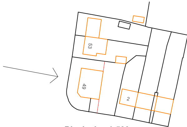
Block plan 1:500