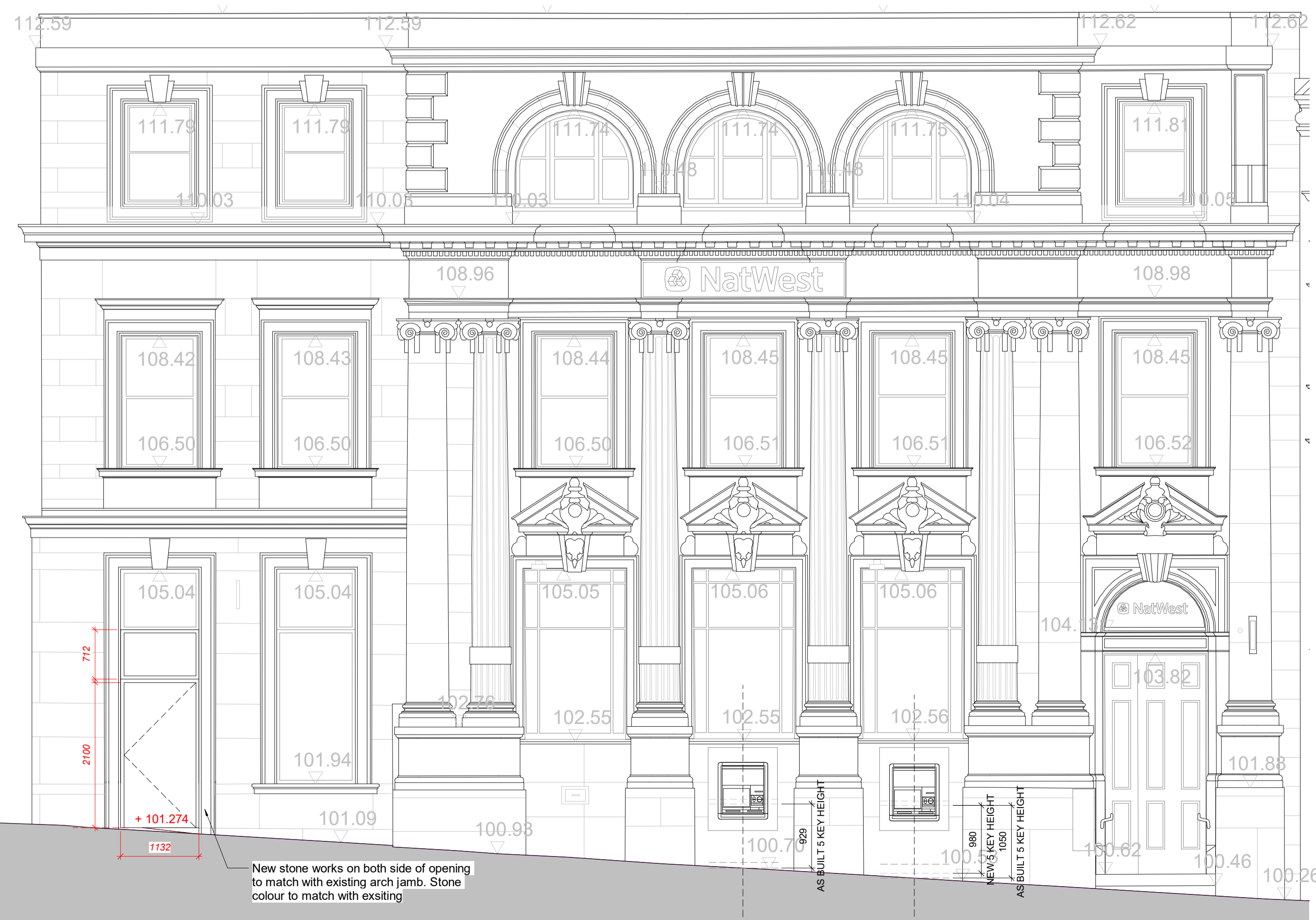
3 PL-00-PROPOSED_ELEVATION-W-EL_VIA ATM 1:50