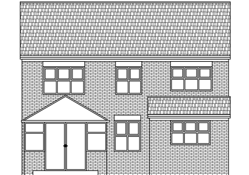
EXISTING REAR ELEVATION SCALE 1:100 AT A3