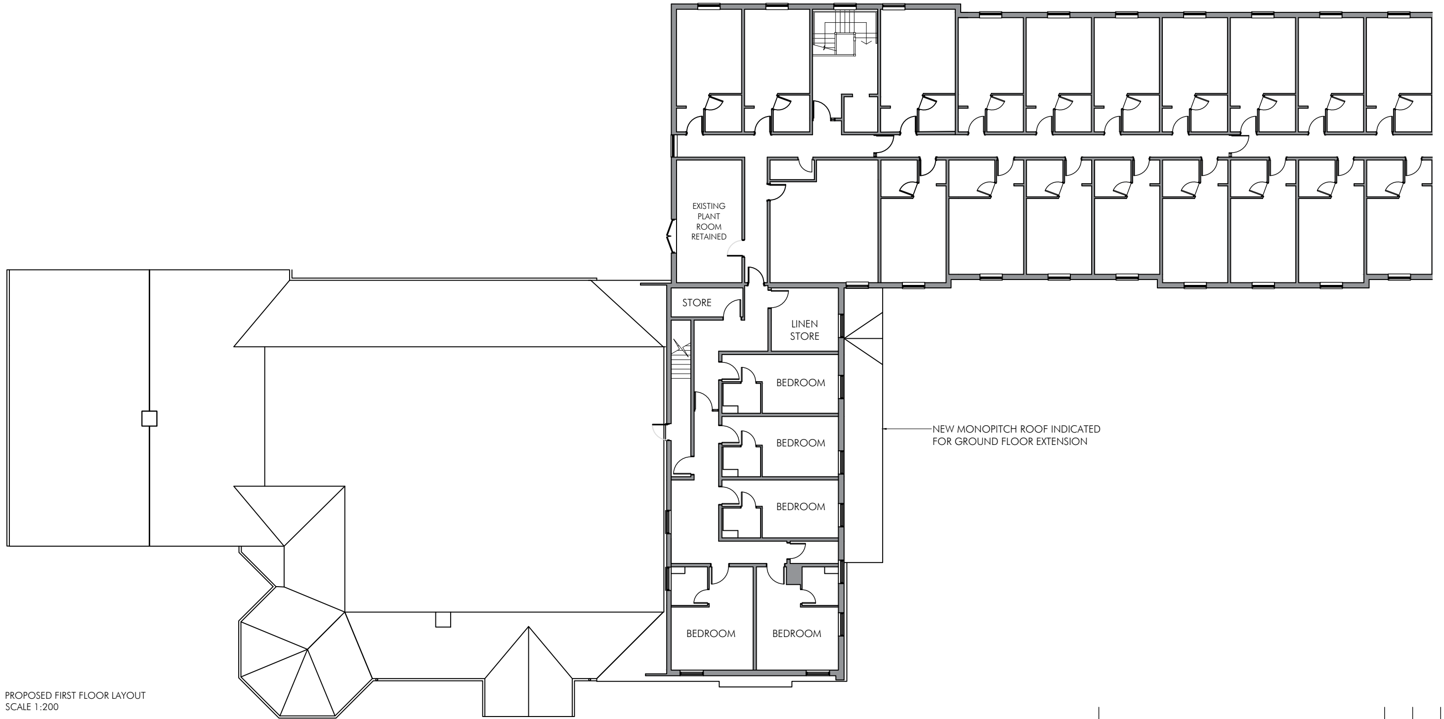
PROPOSED FIRST FLOOR LAYOUT SCALE 1:200