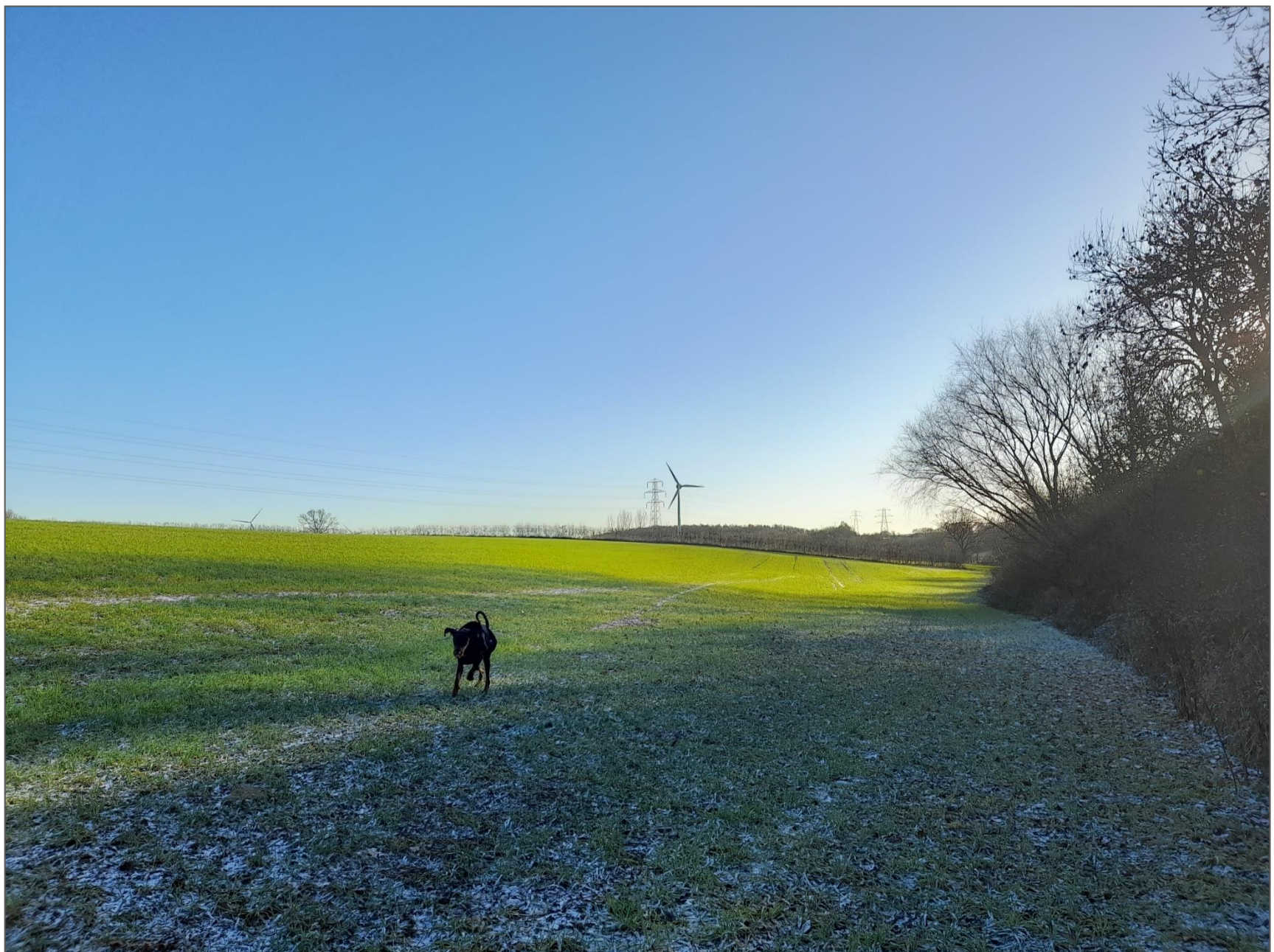
Plate 6: Area 2 – View south along the western Site boundary.