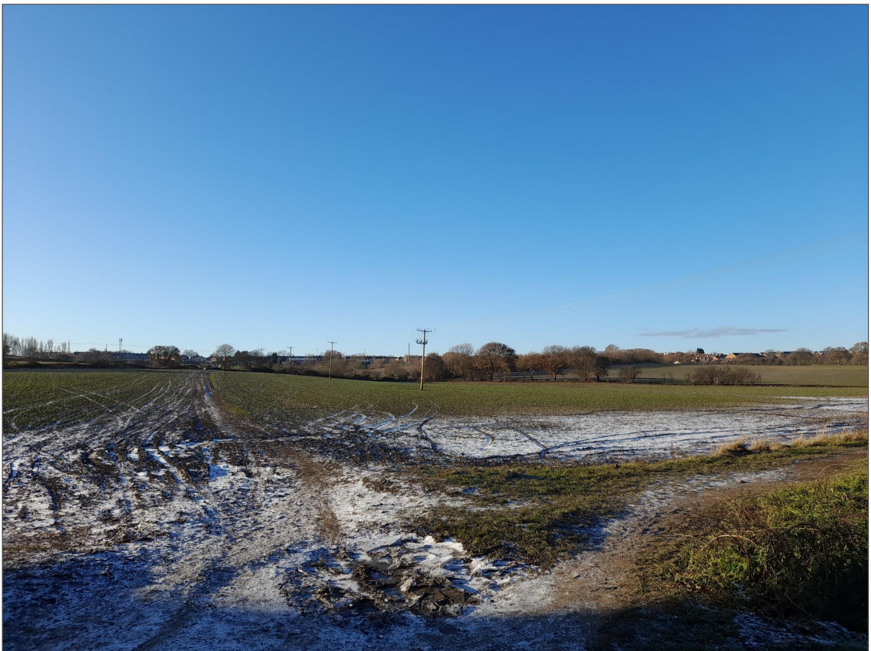
Plate 4: Area 1 - View west across the Site towards Cudworth.