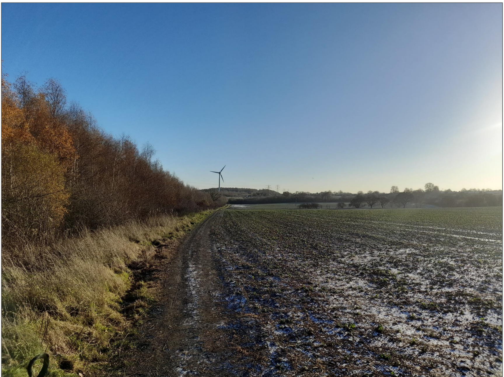
Plate 2: Area 1 - View from the north-east corner to the south, along the eastern Site boundary.