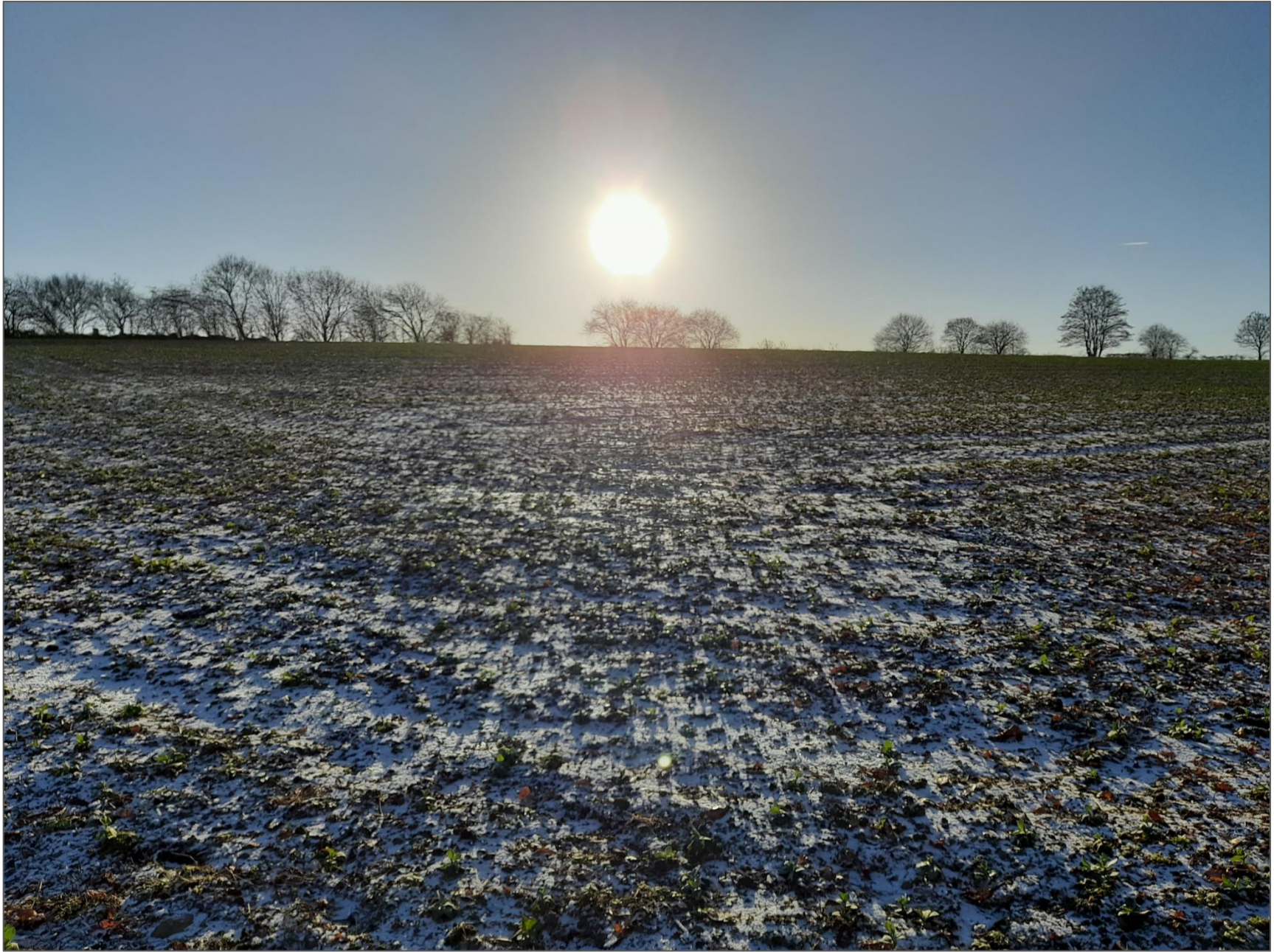
Plate 5: Area 1 – General view looking south-west from south of the south-western corner of the Site.