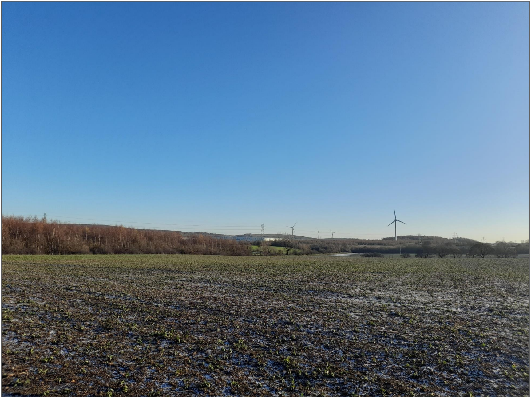
Plate 1: Area 1 - View to the south from the northern Site boundary.