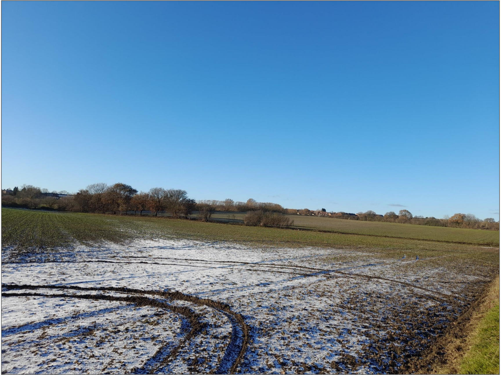
Plate 3: Area 1 - View looking north-west across the Site from the eastern Site boundary.