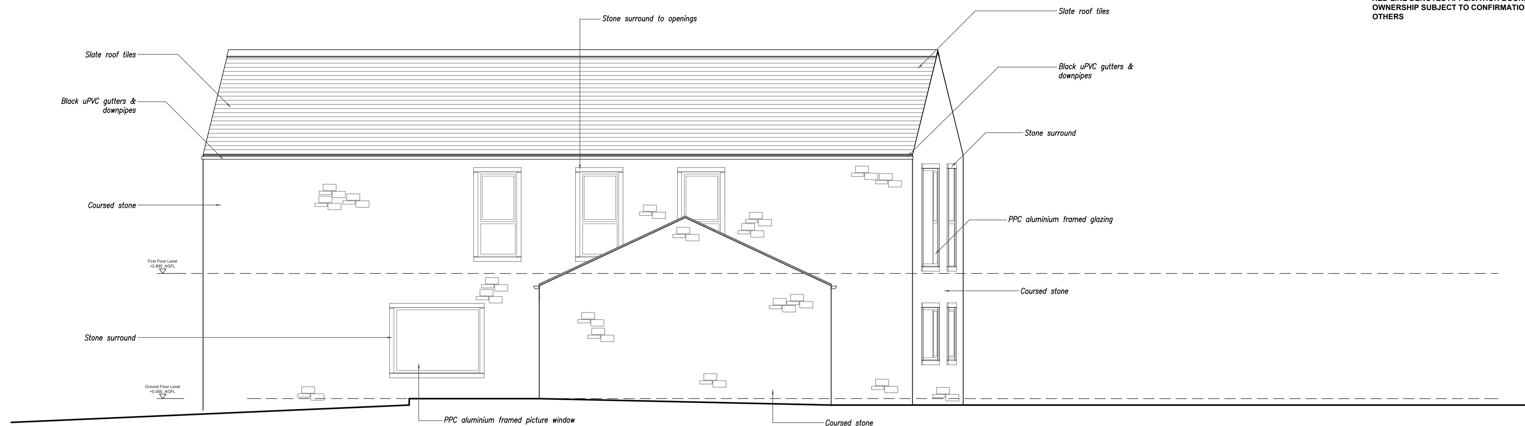
00 Side (East) Elevation 1:50

THIS DRAWING IS NOT TO BE USED FOR CONSTRUCTION PURPOSES. DRAINAGE DETAILS SUBJECT TO DETAIL DESIGN & SITE INVESTIGATION. RED LINE DENOTES APPLICATION BOUNDARY, SITE OWNERSHIP SUBJECT TO CONFIRMATION BY OTHERS