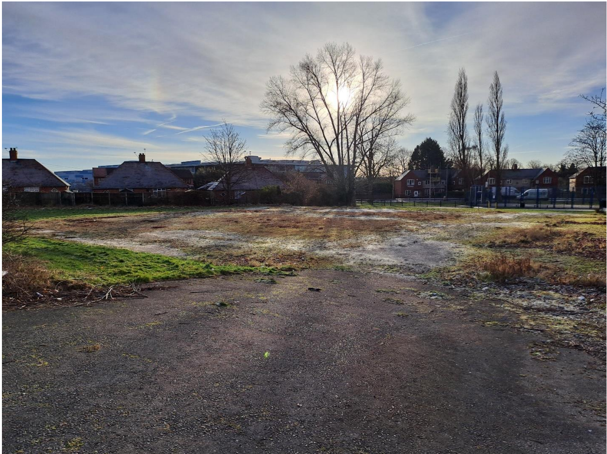
Image 1-Proposed Car Park Location, Welfare Park.

This document is a design and access statement for a planning application for planning permission to promote better quality and more sustainable design. It is proposed to create a 72-space car park on the land that has been derelict for 30 years that was formerly a tennis court within Welfare Park, Goldthorpe, Barnsley. The car park will transform an unused and neglected space into much needed car parking relief to reduce curbside and grass verge parking in Welfare Park and the surrounding area from the patrons of the Dearne Playhouse, Dearne and District Football Club, Goldthorpe Lift Centre, and the I Know I Can Youth Centre.