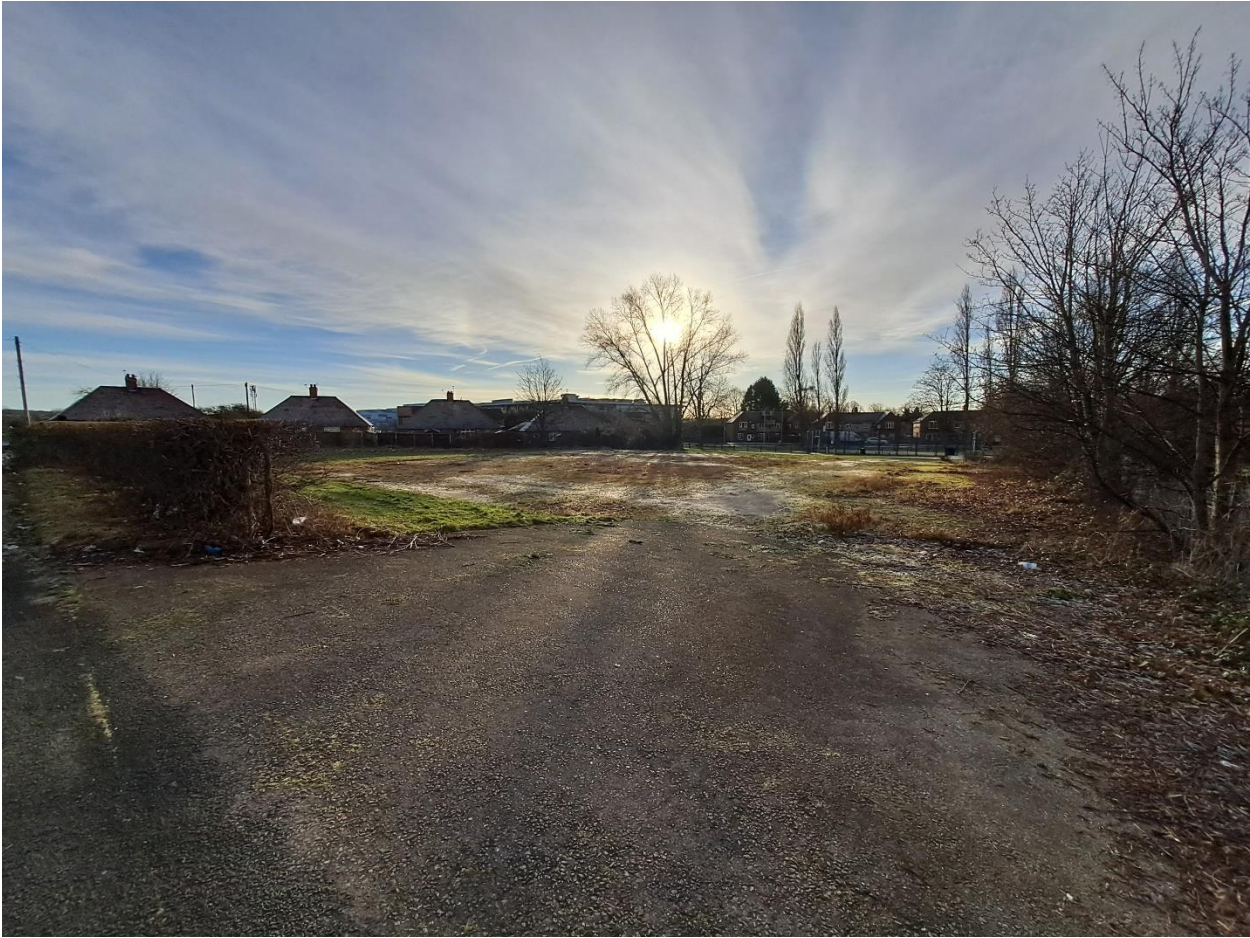
Image 5-Proposed Car Park Entrance, Welfare Park.