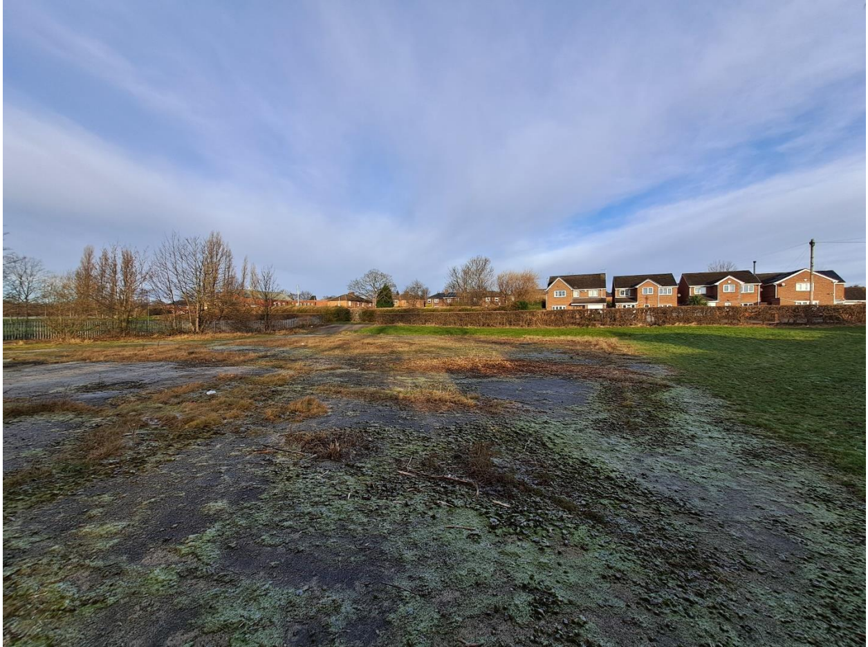
Image 7- Proposed Car Park, Welfare Park.