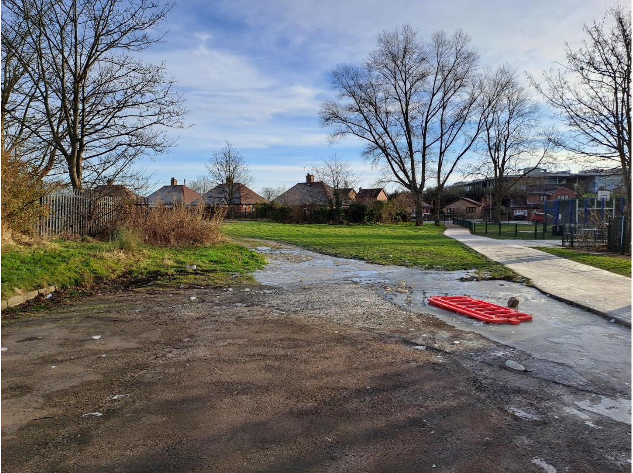
Image 6- Proposed Car Park Exit, Welfare Park.