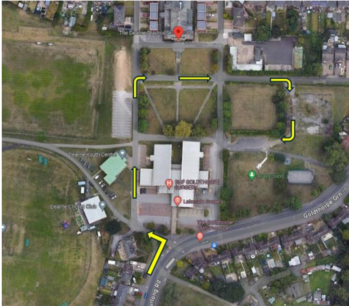
Image 4- Proposed Traffic Flow Route.