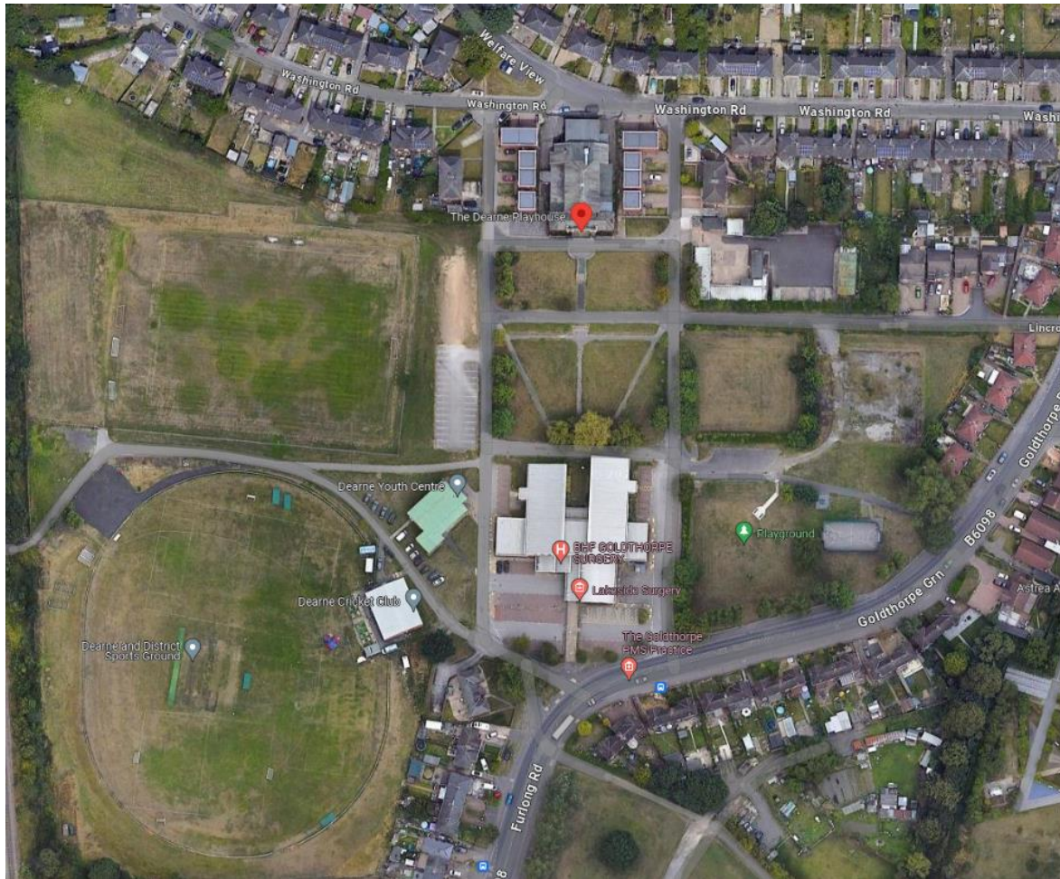
Image 3- Welfare Park Aerial View.