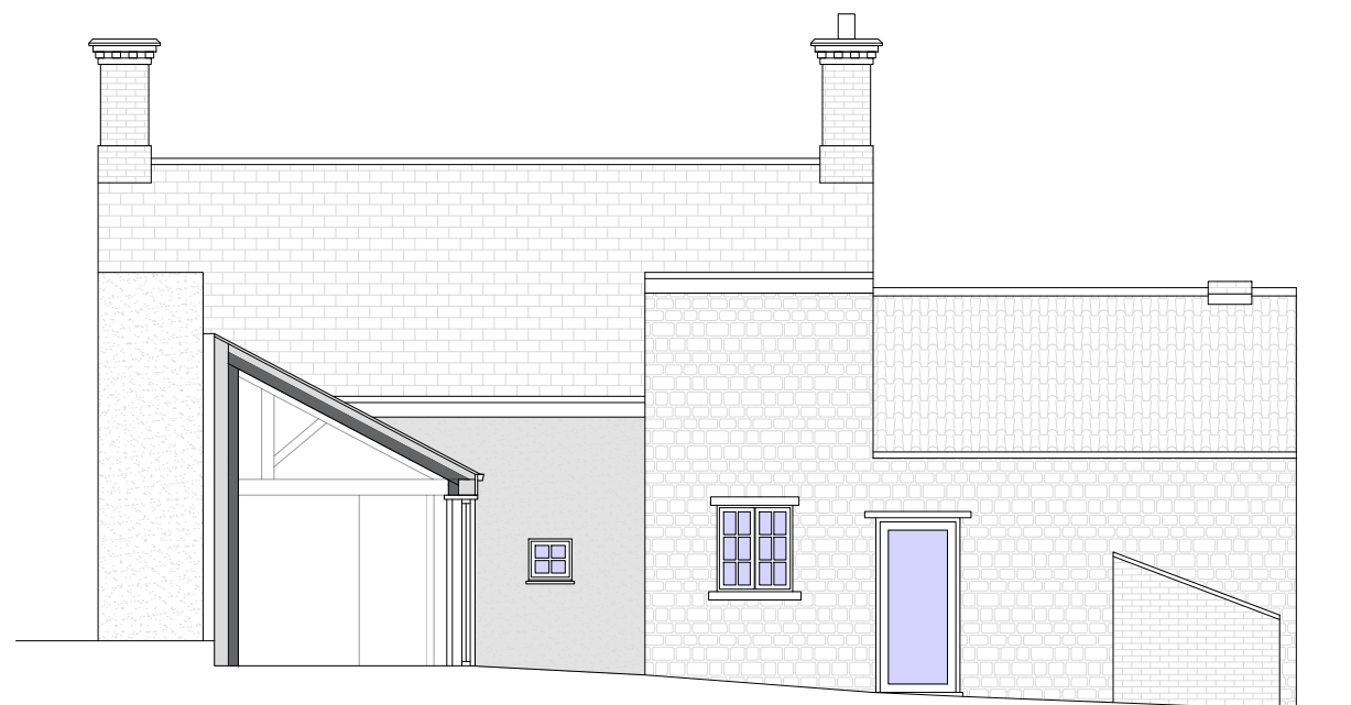
PROPOSED SECTION B-B

Sherline Profile Door with panels either side in Aluminium traditional panel effect in RAL7032 Pebble Grey Panel to side to match door.