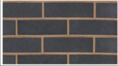
wienerberger Terca engineering brick blue perforated class B 65mm(or similar) below ground and up to DPC level with grey colour mortar