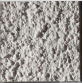
limestone white render by K Rend or similar approved

Stancliffe House Farm (former kennel site) Woodhead Road Wortley Sheffield S35 7DA