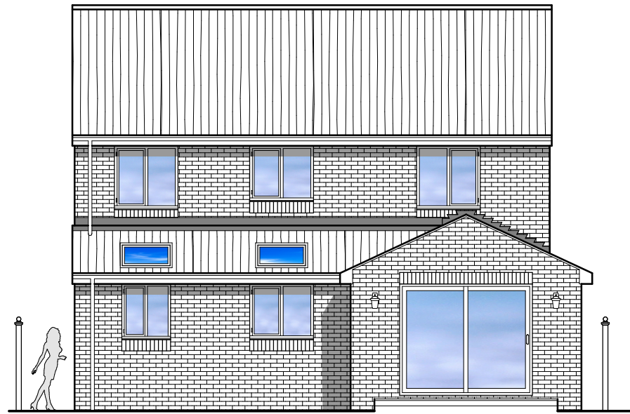
Rear Elevation facing Private Garden as Proposed

The Construction (Design and Management) Regulations 2015 These do generally apply to smaller projects and work by a householder on their own property. Further guidance is available from the Health and Safety Executive who may be contacted 01142 912 300 or 0870 1545500. See attached notes.