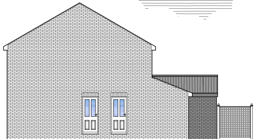
Side Elevation facing adjacent Property as Proposed